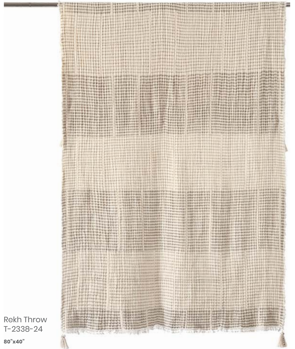
Rekh Throw T-2338-24