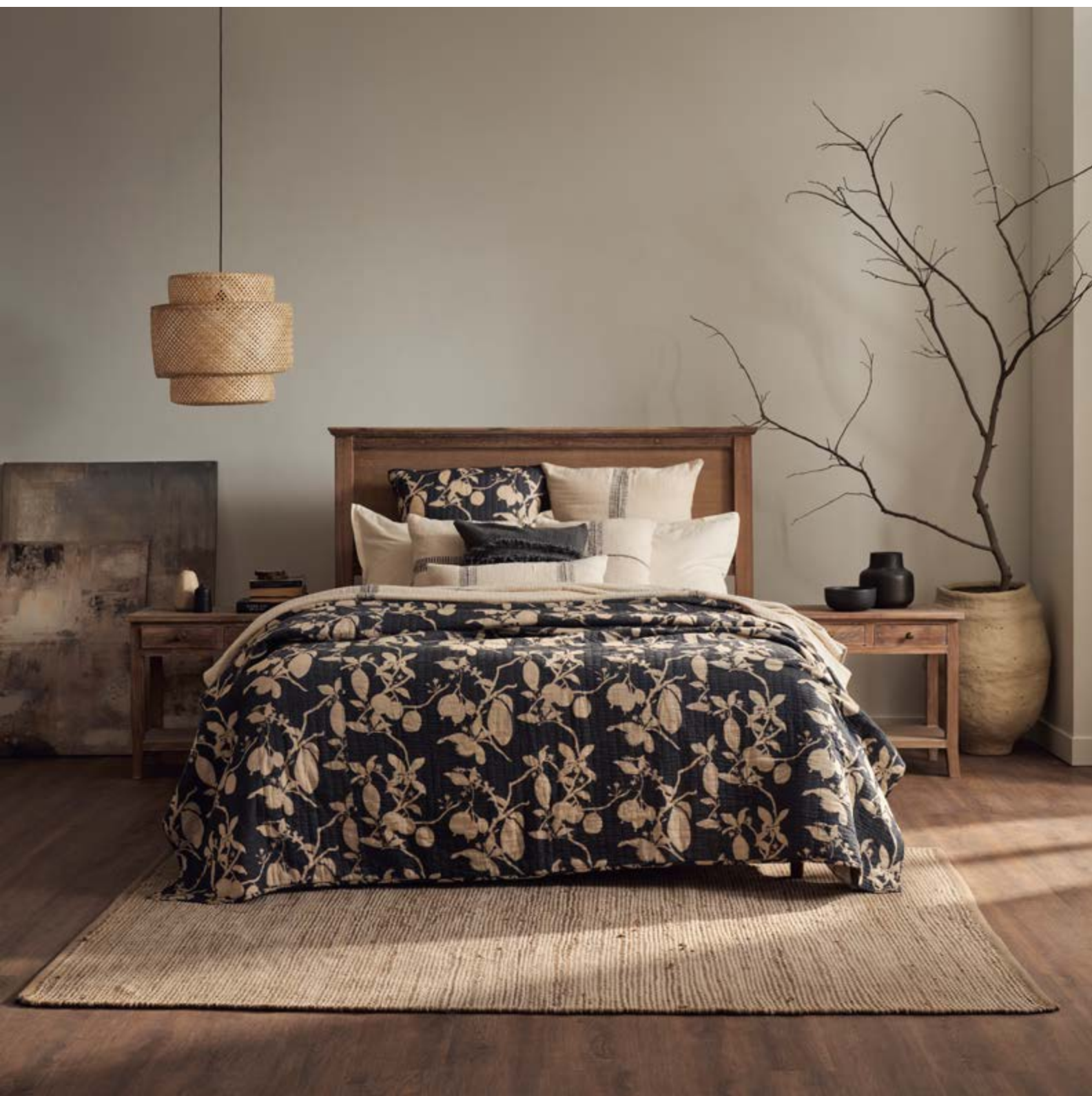
Pear Quilt Q-2364-24