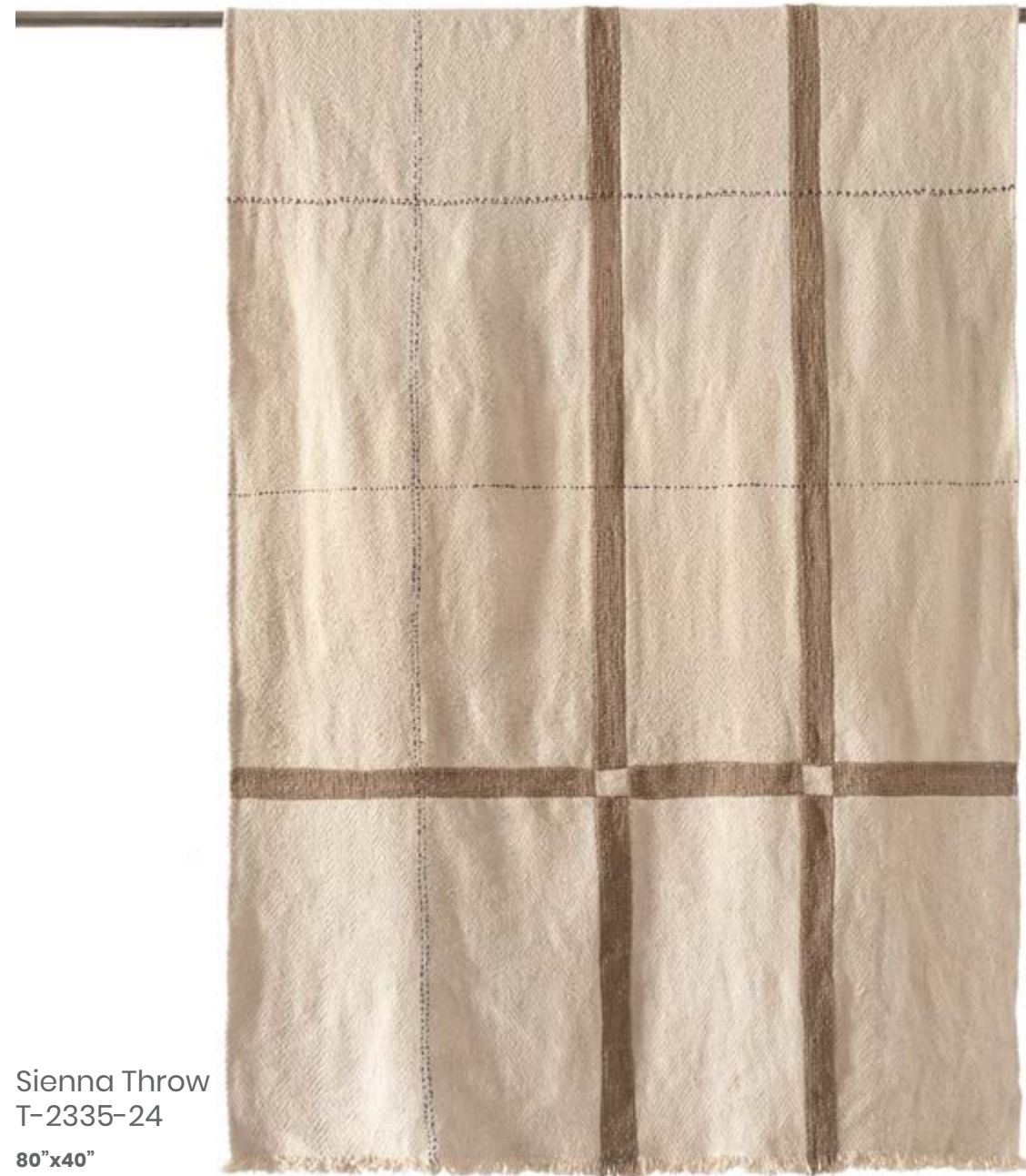
Sienna Throw T-2335-24 80"x40"

This extremely soft yet structured cotton throw is brushed and felted to increase the handfeel. Stripes of slubby cotton are patched and beautiful hand kantha lines are thoughtfully designed, creating a larger than life canvas of checks. The back is frayed at all the joints, creating an interesting play of texture. Hand washed to further achieve soft and relaxed textural appeal, Sienna adds a unique touch to modern decor.