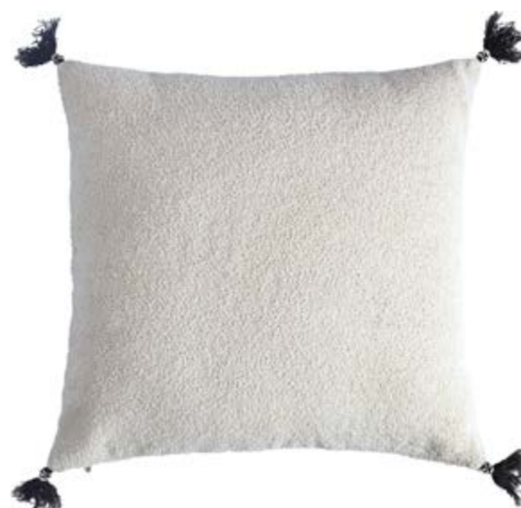
Renee Sham C-2358-24 Natural 26"x26"