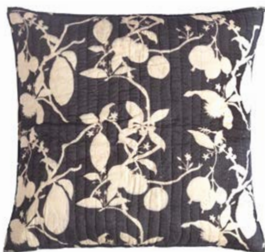
Pear Sham C-2364-24