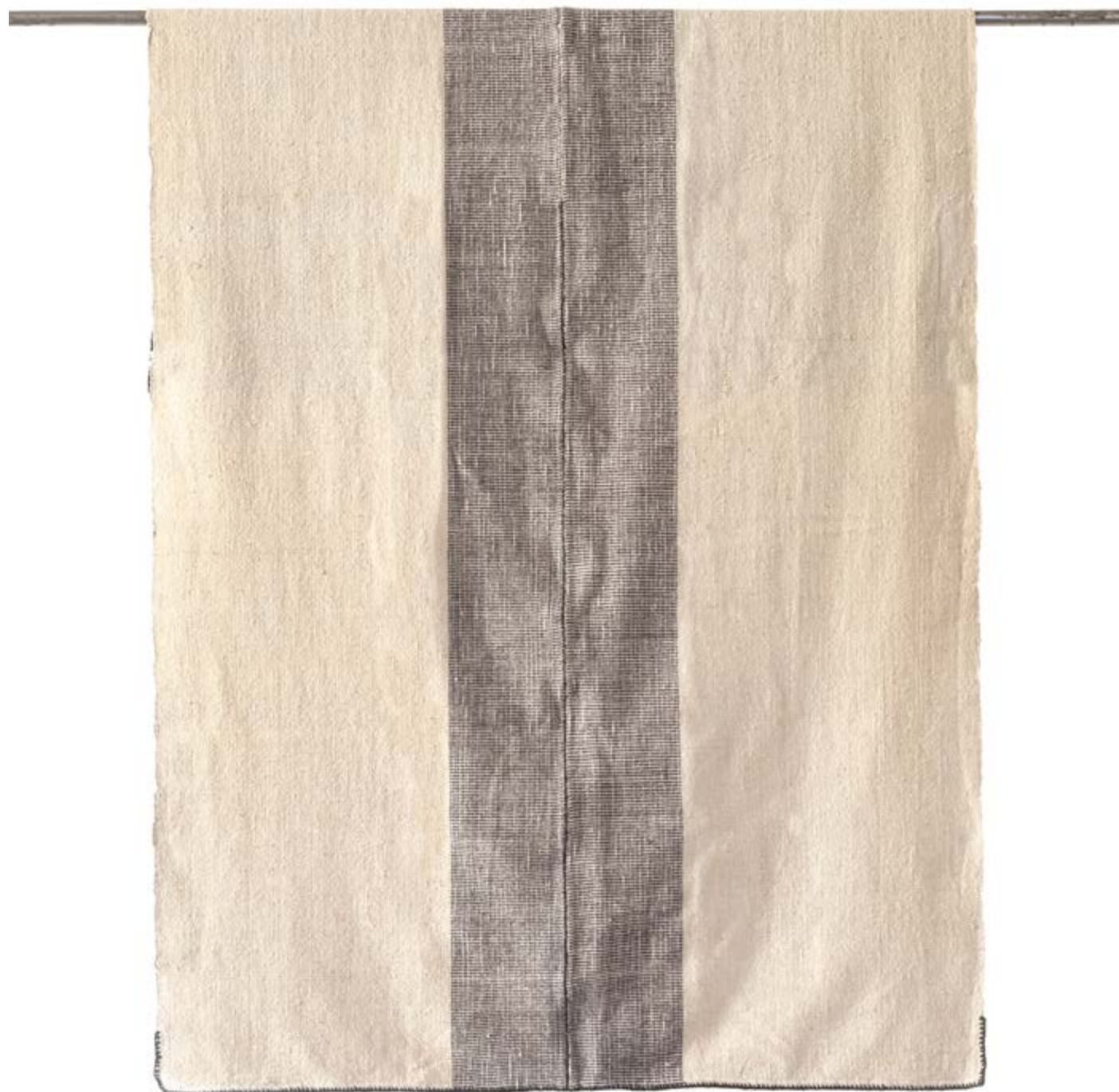
Nyasa Throw T-2000