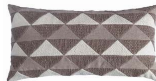
Capa Cushion C-2349-24