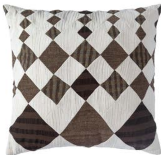
Coba Sham C-2356-24 Natural/Raw umber 26"x26"