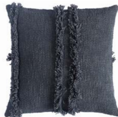
Nami Cushion C-2342-24