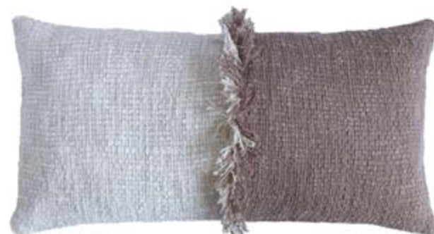
Shiori Cushion C-2353-24