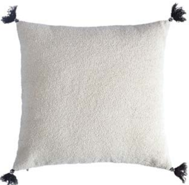
Renee Sham C-2358-24