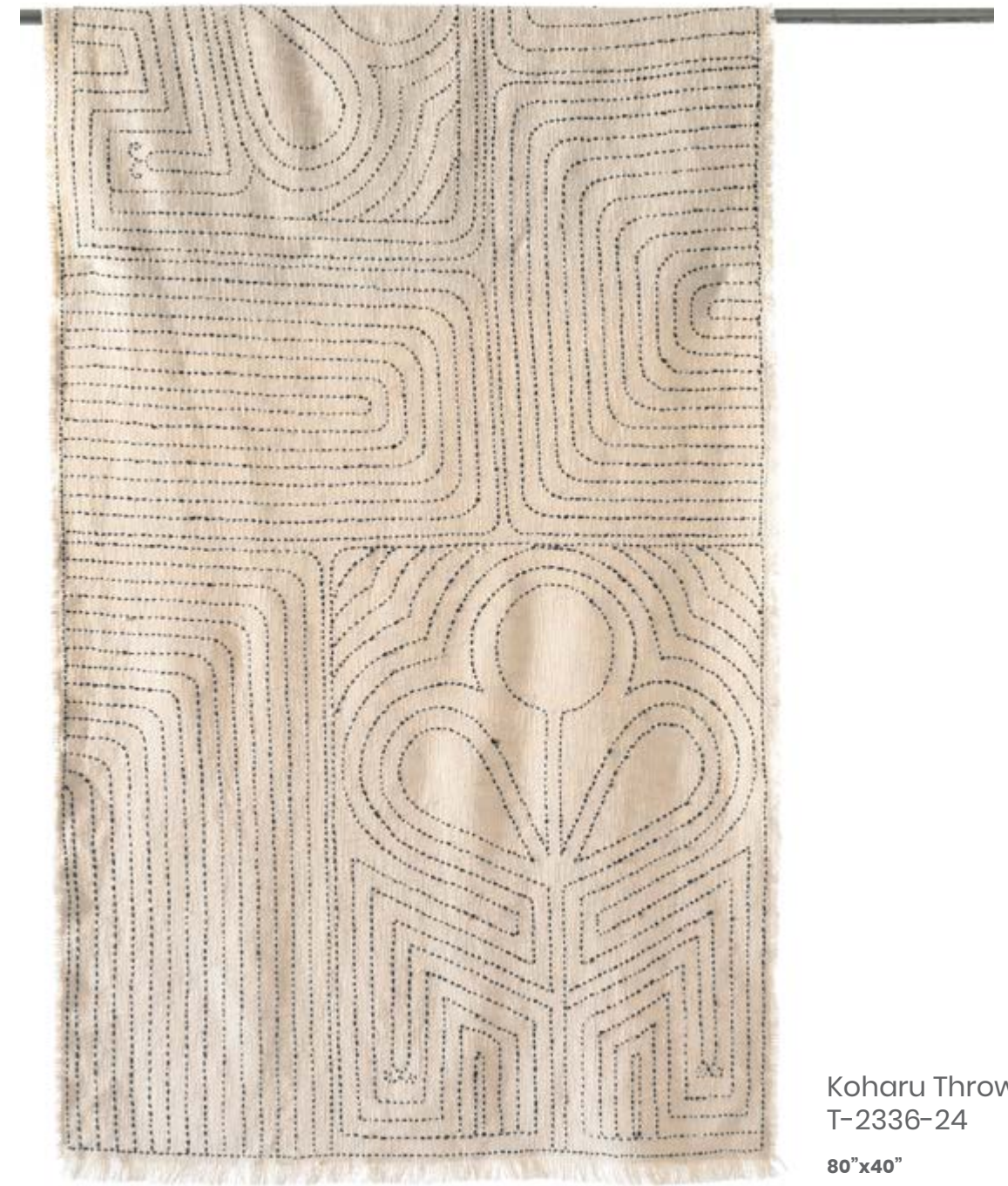
Koharu Throw T-2336-24

Beautifully handcrafted Cruso is a woven cotton throw, with different thicknesses of cotton yarn used in the warp and weft. The distinctive slubbiness of the throw has a unique textural experience, and the frayed sides add to its raw appearance. Handwashed to further achieve softer and relaxed textural appeal, Cruso is available in a classic colour palette of natural and mocha.