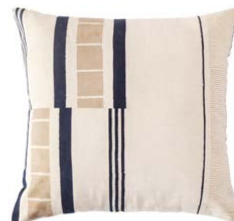
Pave Cushion C-2344-24 Natural/Indigo/Sandstone 19"x19"