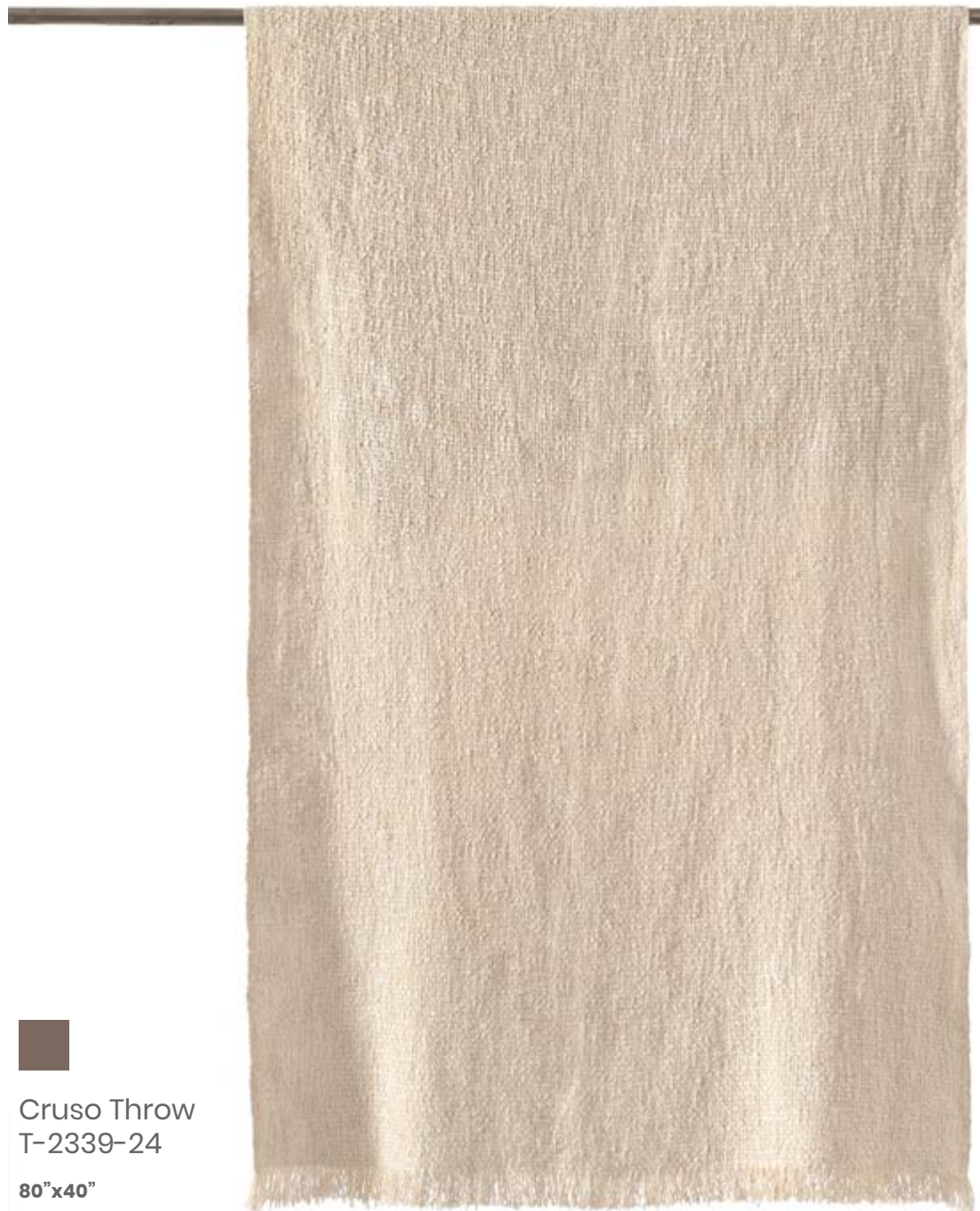
Cruso Throw T-2339-24