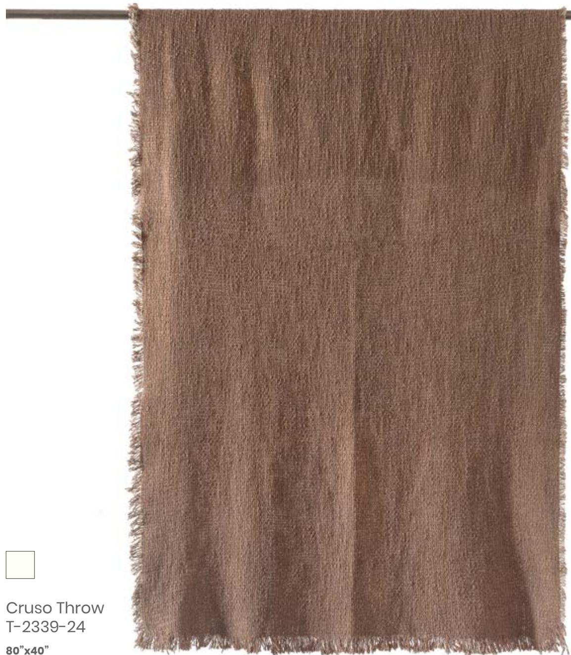
Cruso Throw T-2339-24 80"x40"