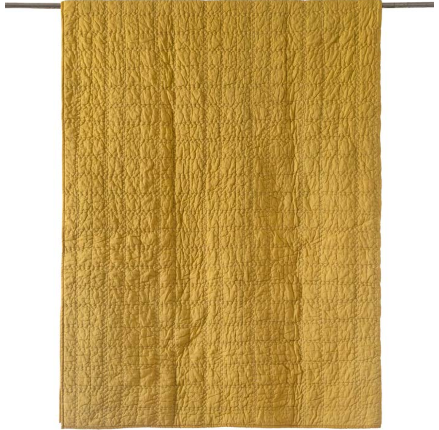
Checkbox Quilt Q-1106