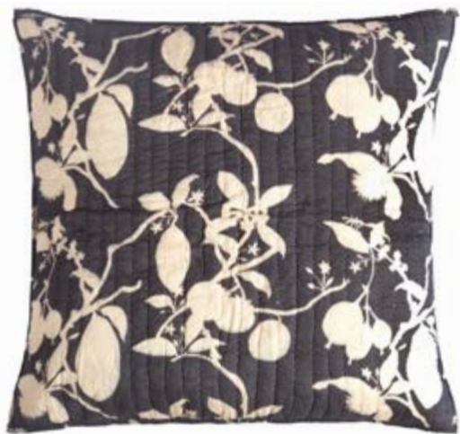
Pear Sham C-2364-24 Charcoal 26"x26"