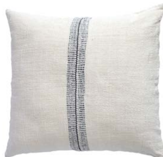
Marina Sham C-2357-24