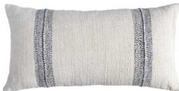
Kai Cushion C-2350-24