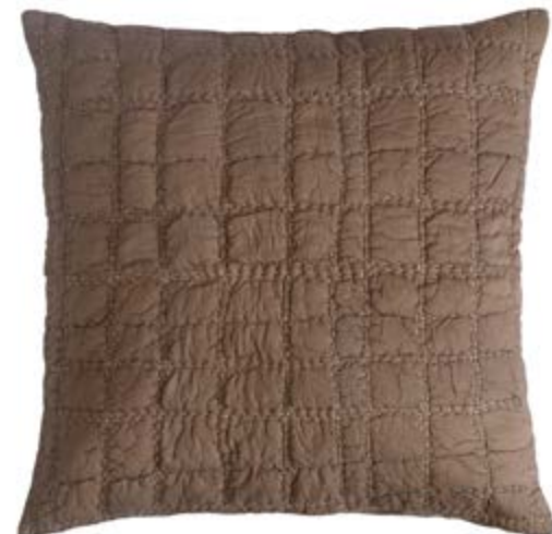
Checkbox Sham S-1106