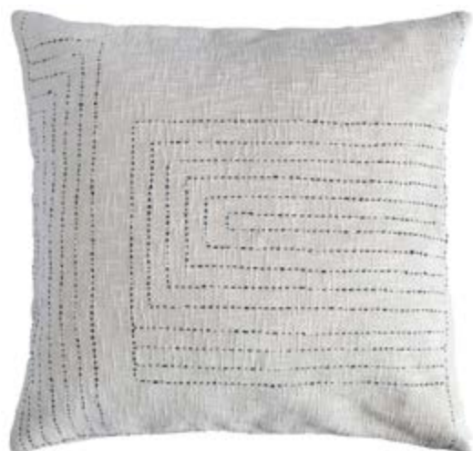
Luna Sham C-2355-24