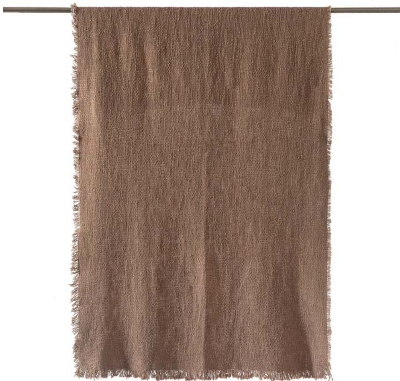
Cruso Throw T-2339-24