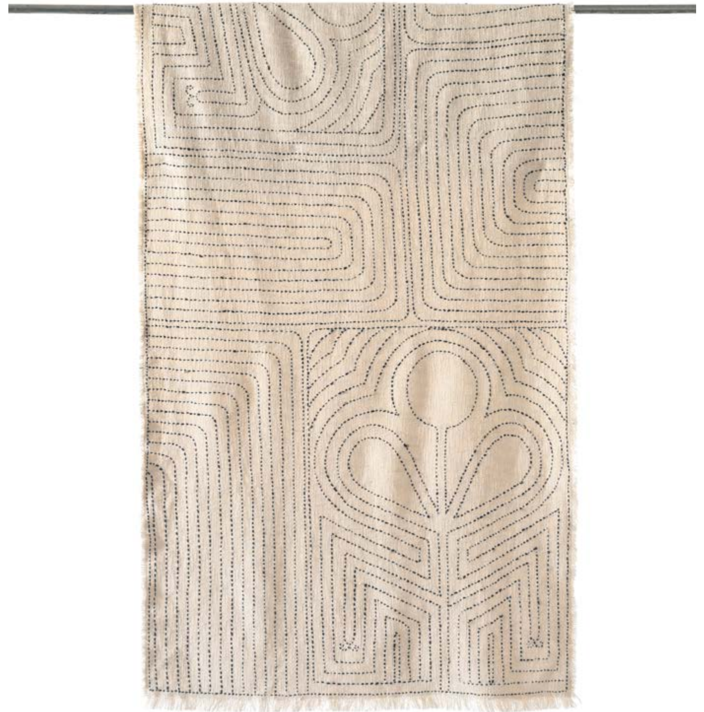
Koharu Throw T-2336-24