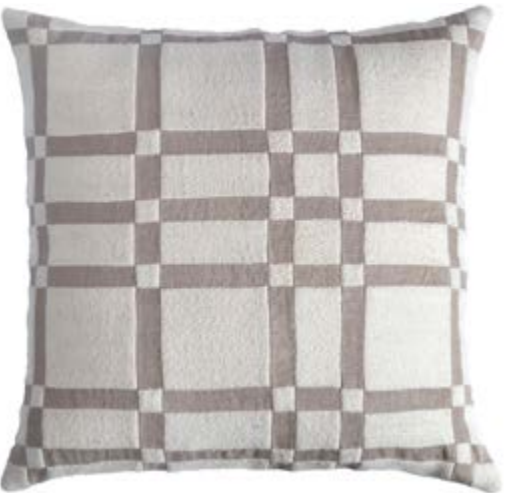
Maive Sham C-2354-24 Natural/Sandstone 26"x26"