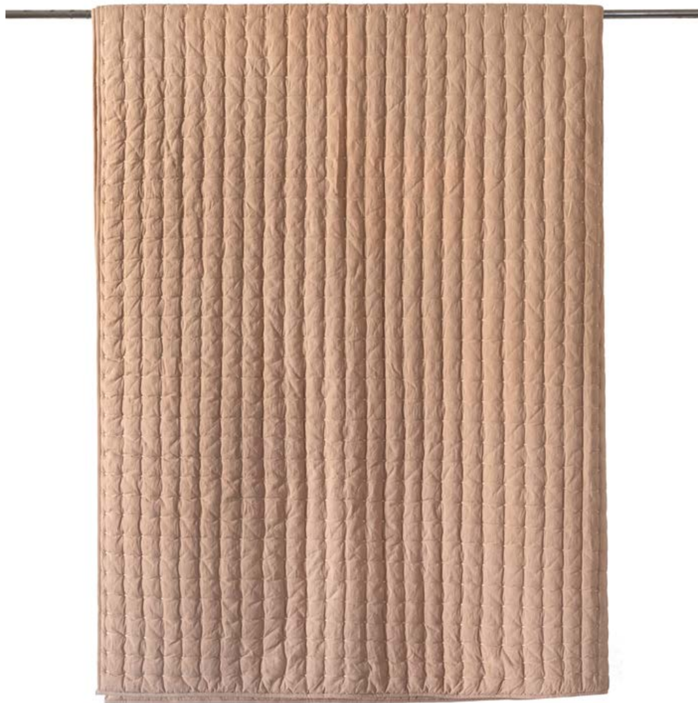
Pebble Quilt Q-2001