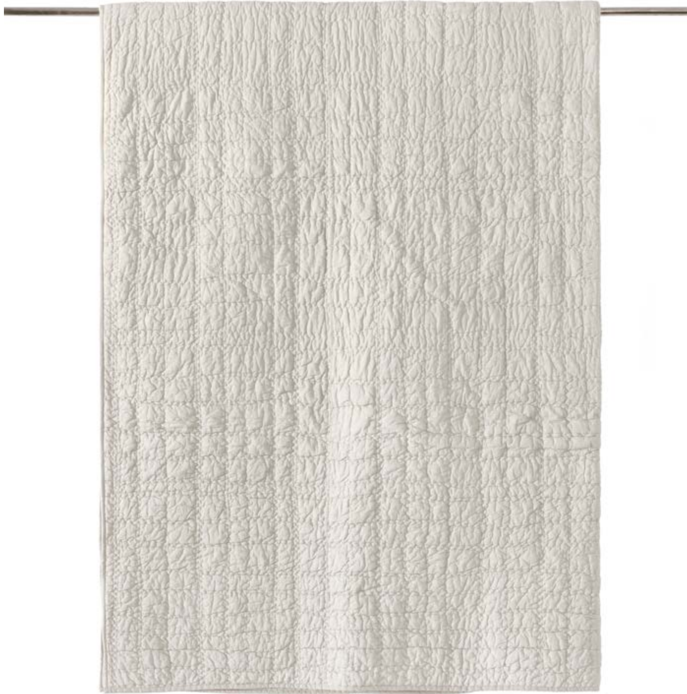
Checkbox Quilt Q-1106