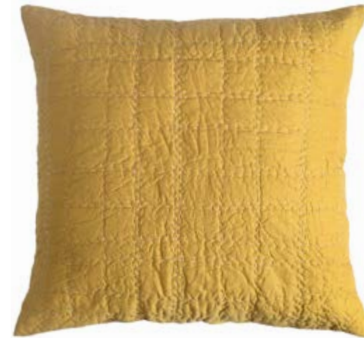
Checkbox Sham S-1106