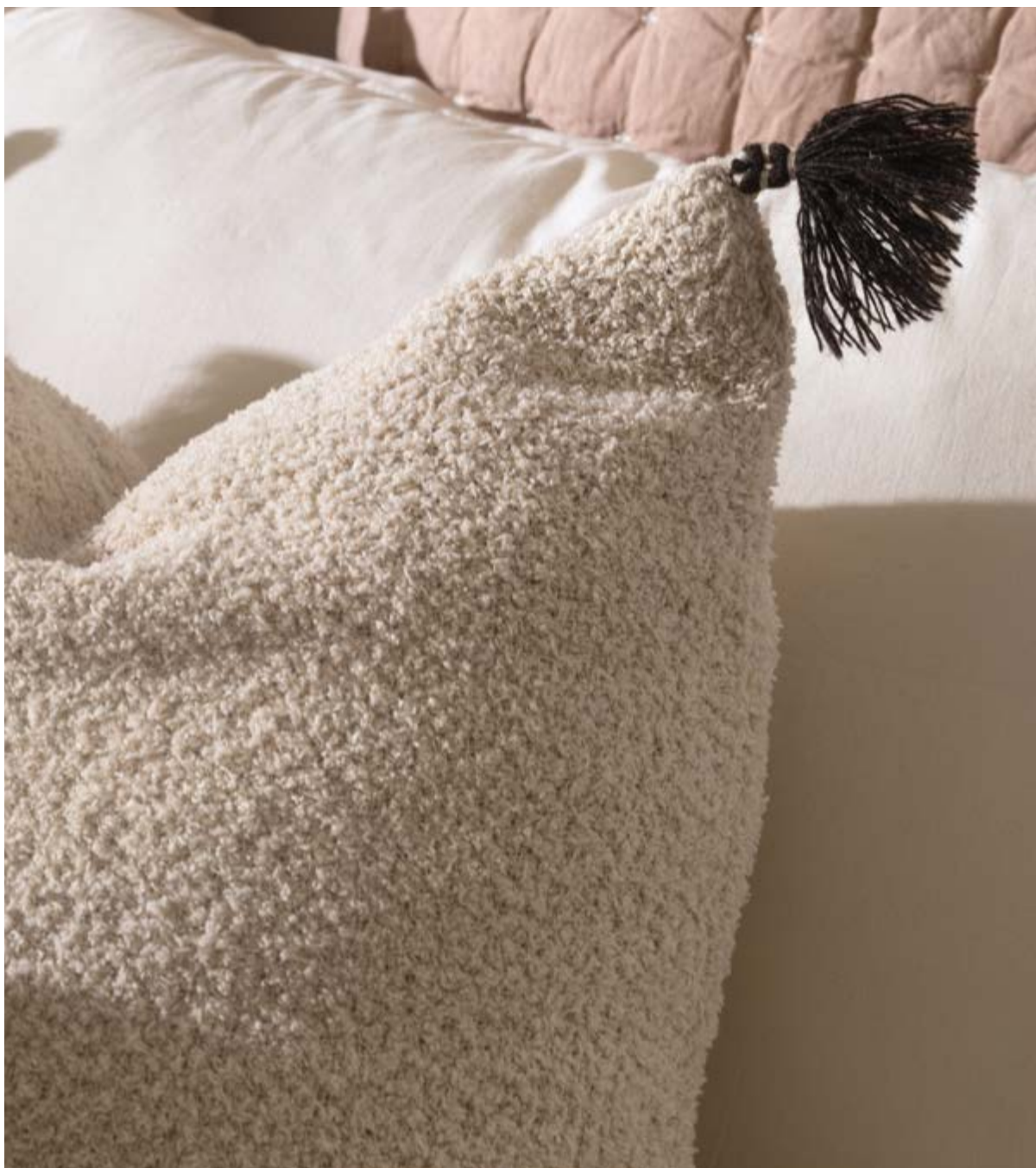
Zuha Cushion C-2346-24