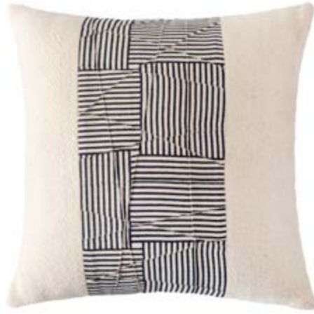
Wiyona Cushion C-2343-24