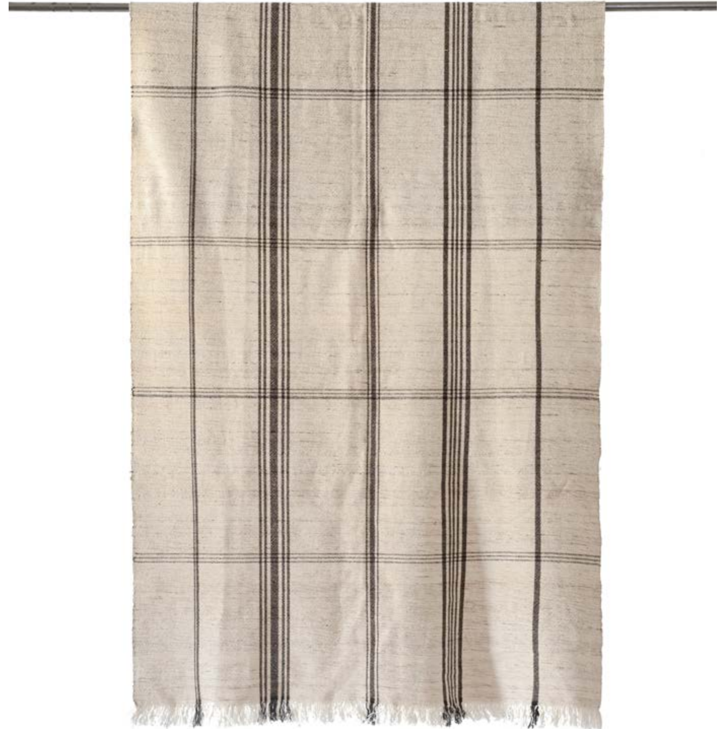
Oban Throw T-3421