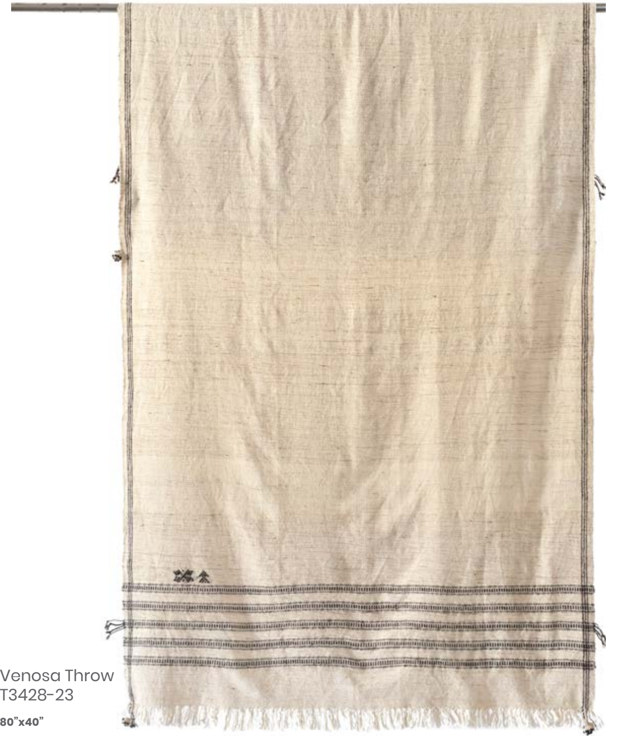
Venosa Throw T3428-23