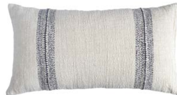
Kai Cushion C-2350-24