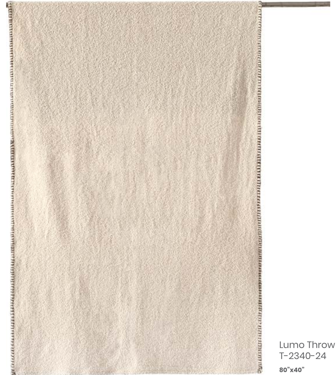
Lumo Throw T-2340-24 80"x40"

This extremely soft yet structured cotton throw is brushed and felted to increase the handfeel. Stripes of slubby cotton are patched and beautiful hand kantha lines are thoughtfully designed, creating a larger than life canvas of checks. The back is frayed at all the joints, creating an interesting play of texture. Hand washed to further achieve soft and relaxed textural appeal, Sienna adds a unique touch to modern decor.