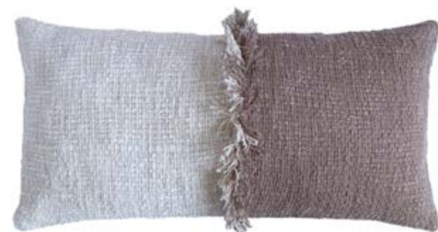
Shiori Cushion C-2353-24