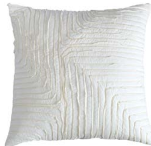
Pearl Sham S-2366-24 Natural 26"x26"