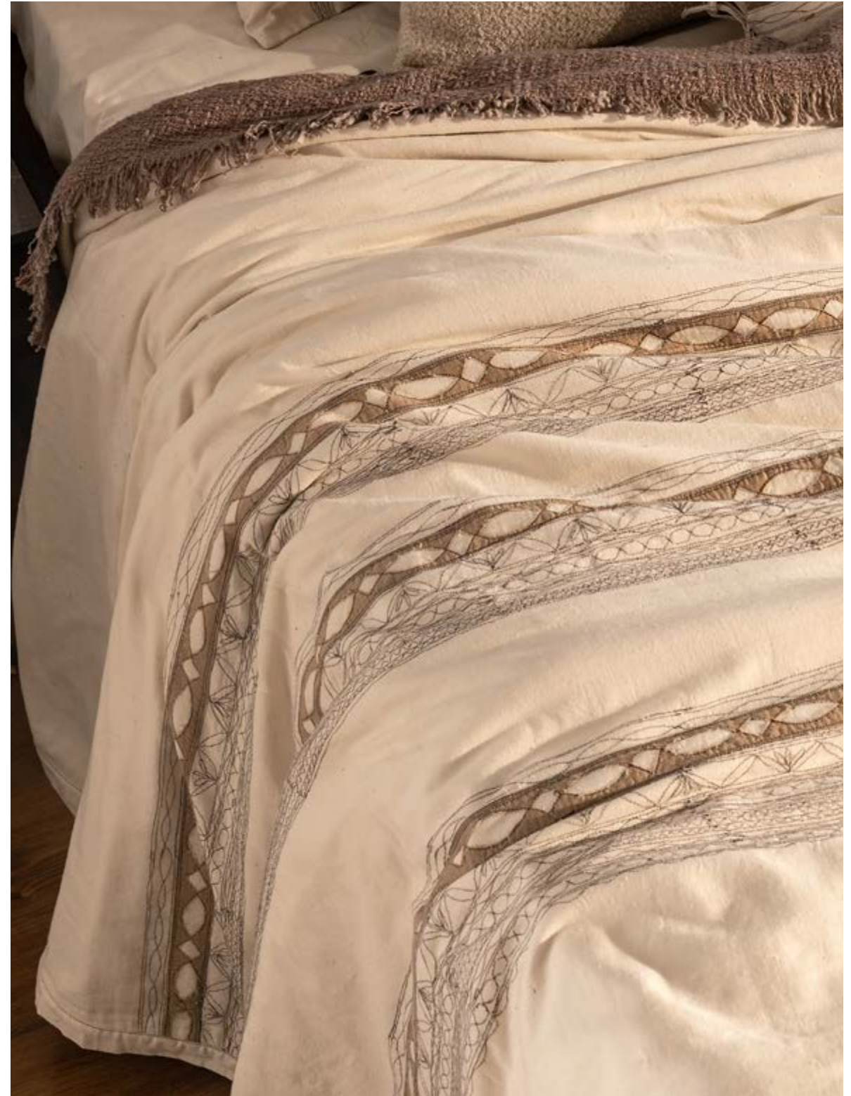
Kiyomi Blanket B-2361-24