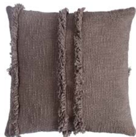
Nami Cushion C-2342-24