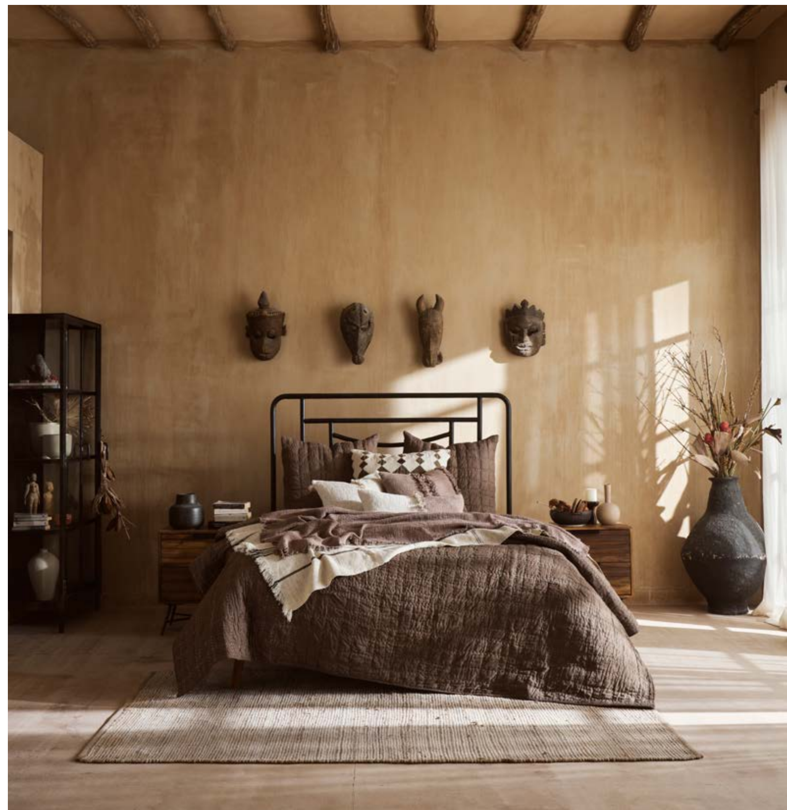
Checkbox Quilt Q-1106

Crafted with fine cotton is our signature Check Box quilt. With hand quilting all throughout using a distinct pop of colour to create striking checkered pattern, it is heavily washed for textural richness. This quilt is mid weighted and its easy care makes them perfect for year-round use. Each piece is filled with 100% cotton and is available in white, indigo, misted rose, sepia and citrus.