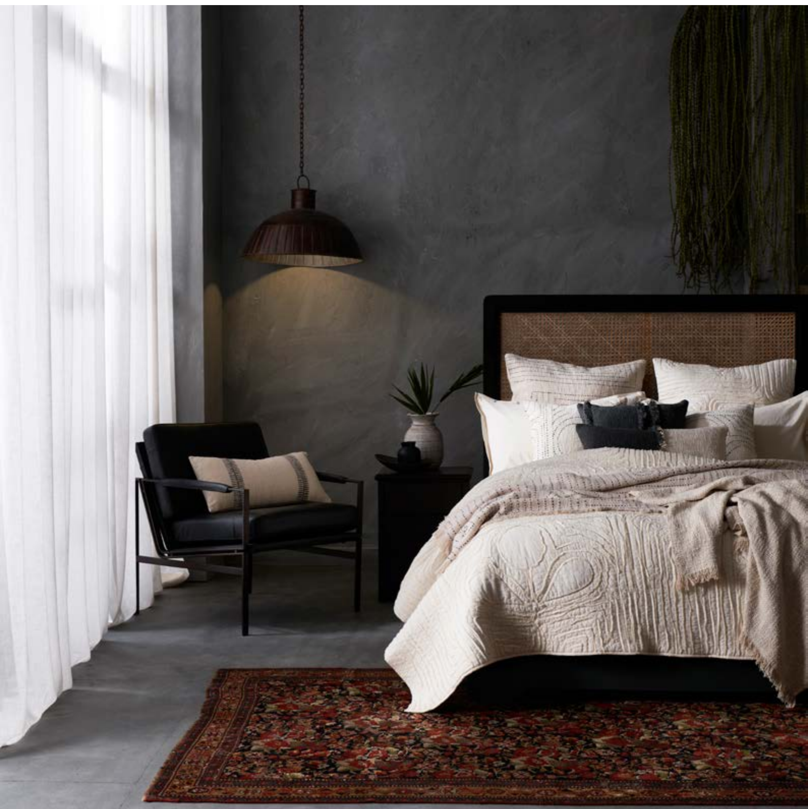
Pearl Quilt Q-2366-24