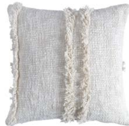
Nami Cushion C-2342-24