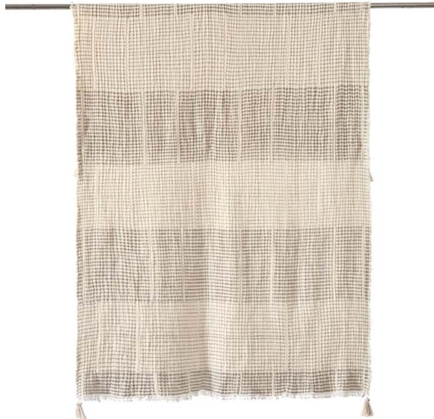
Rekh Throw T-2338-24