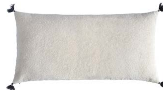
Elise Cushion C-2351-24