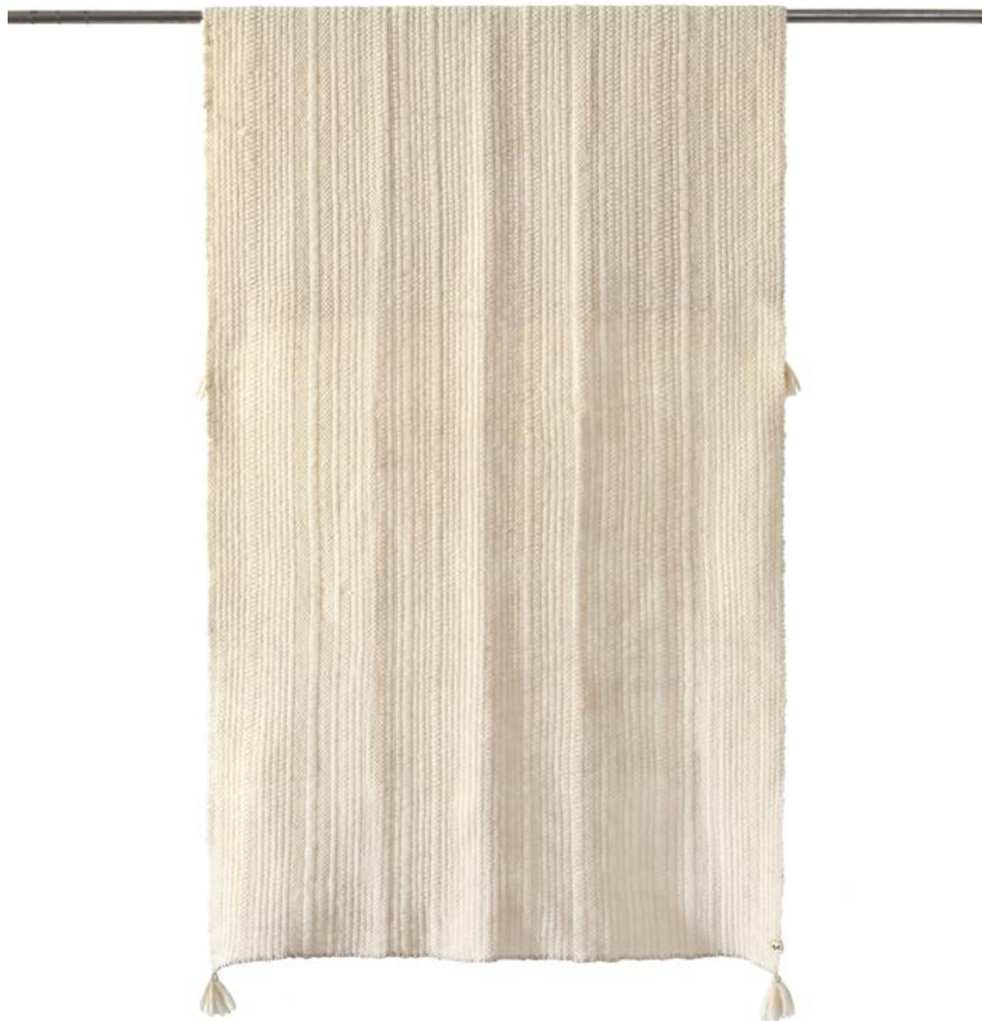
Rimo Throw T-3429-23