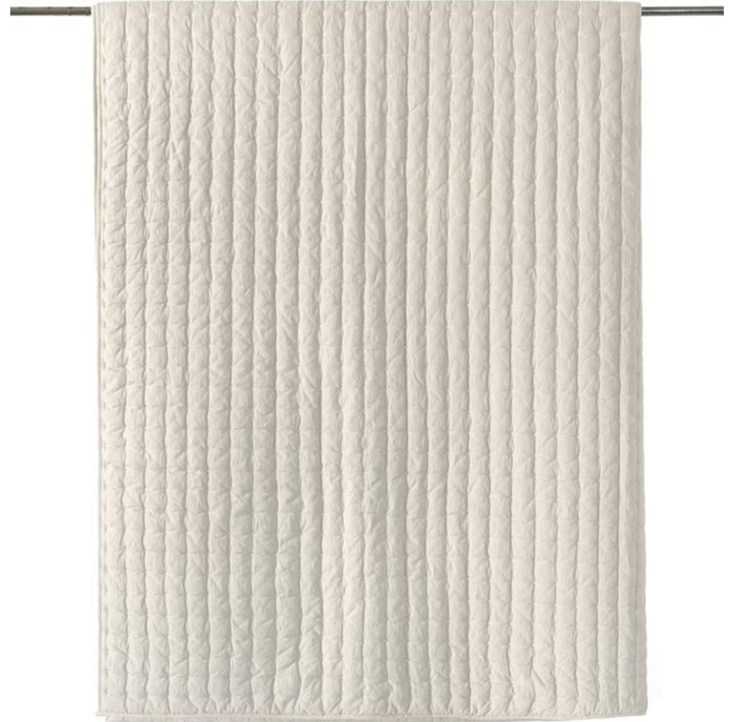
Pebble Quilt Q-2001