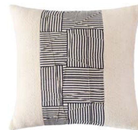
Wiyona Cushion C-2343-24 Natural/Indigo 19"x19"