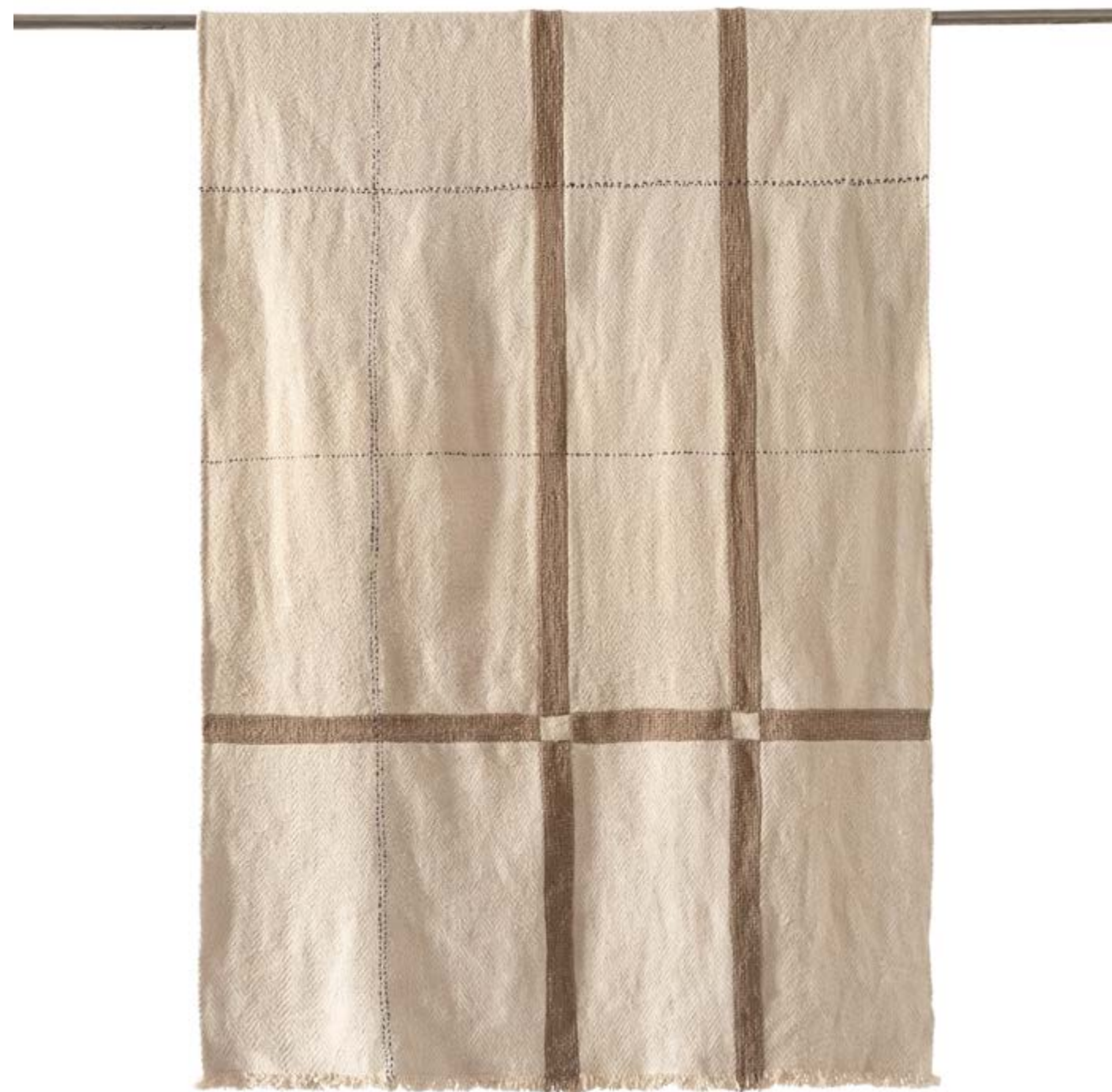
Sienna Throw T-2335-24