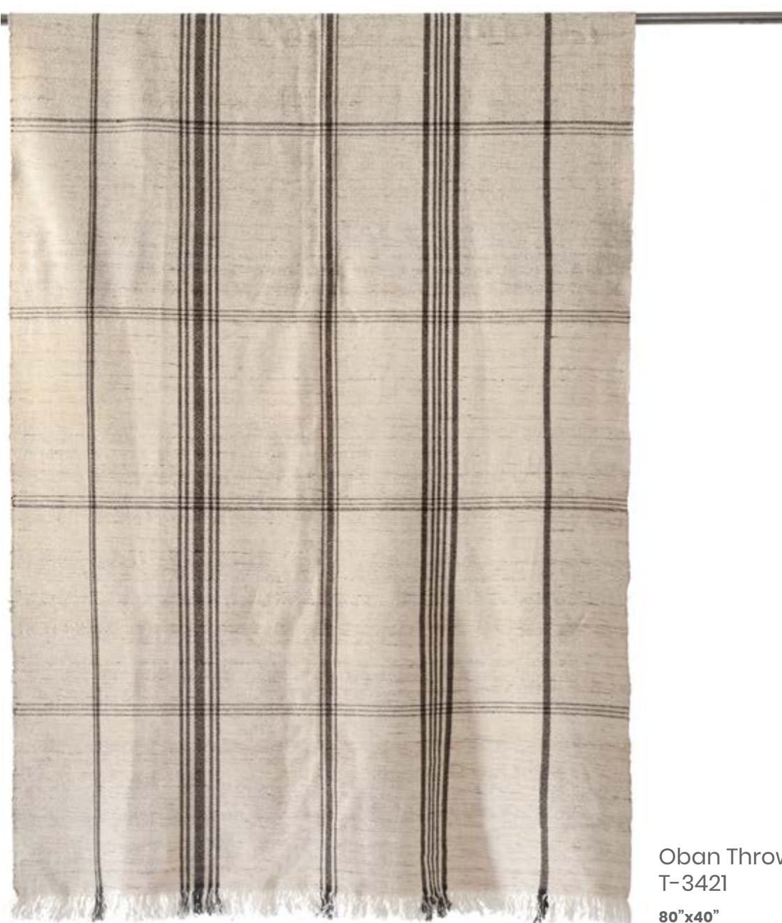
Oban Throw T-3421 80"x40"

Beautifully handcrafted Cruso is a woven cotton throw, with different thicknesses of cotton yarn used in the warp and weft. The distinctive slubbiness of the throw has a unique textural experience, and the frayed sides add to its raw appearance. Handwashed to further achieve softer and relaxed textural appeal, Cruso is available in a classic colour palette of natural and mocha.