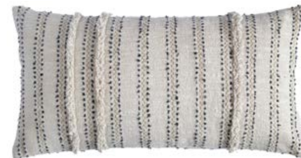
Alin Cushion C-2348-24