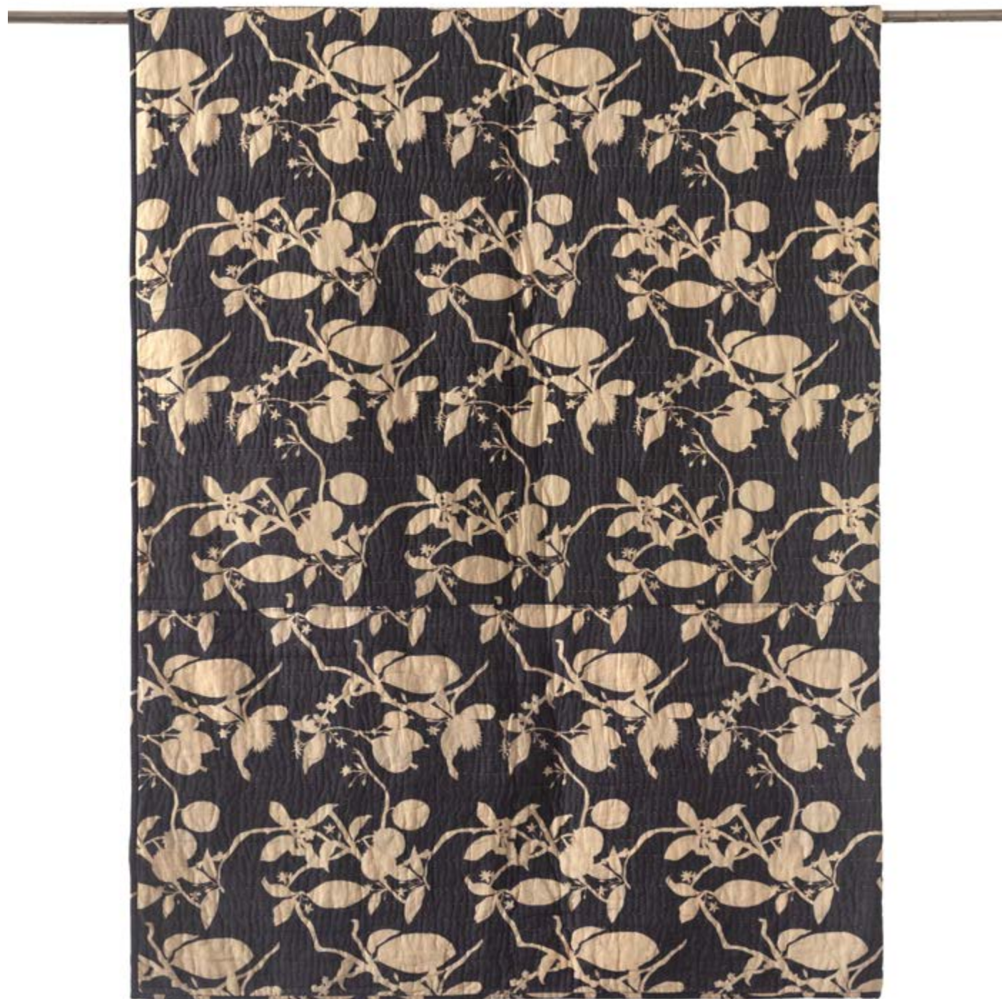
Pear Quilt Q-2364-24