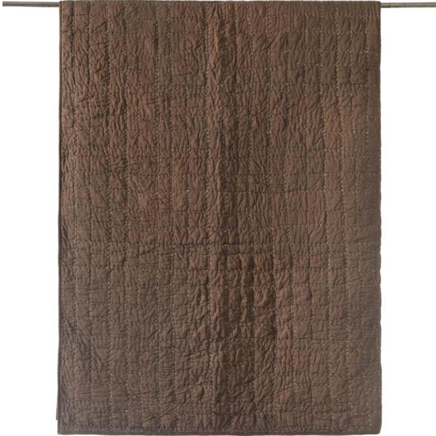
Checkbox Quilt Q-1106