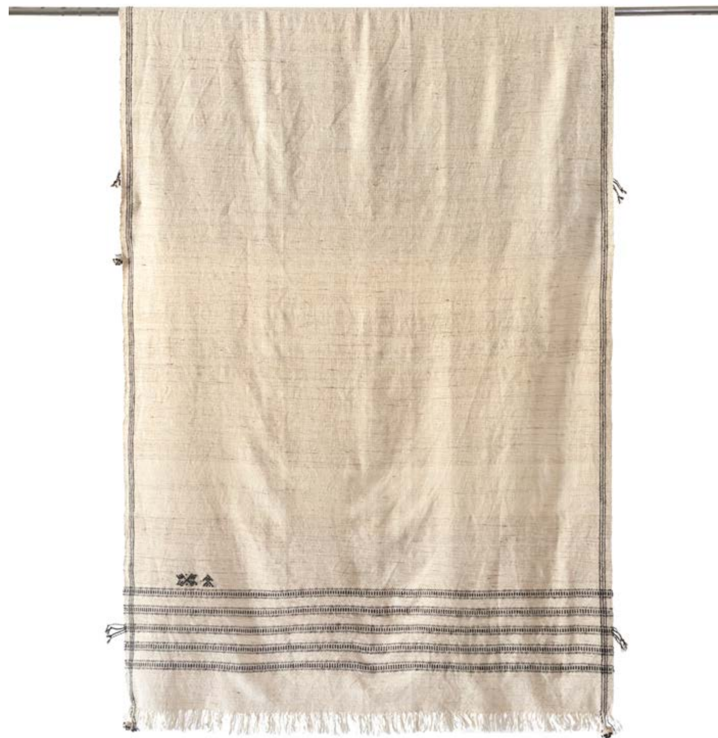
Venosa Throw T-3428-23