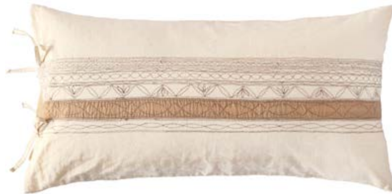
Yumi cushion C-2352-24

Delicate embroidery stitches running in a subtle combination of brown and white on khadi, the Haru cushion features an amalgamation of tradition and contemporary. The cushion is enclosed with ties.