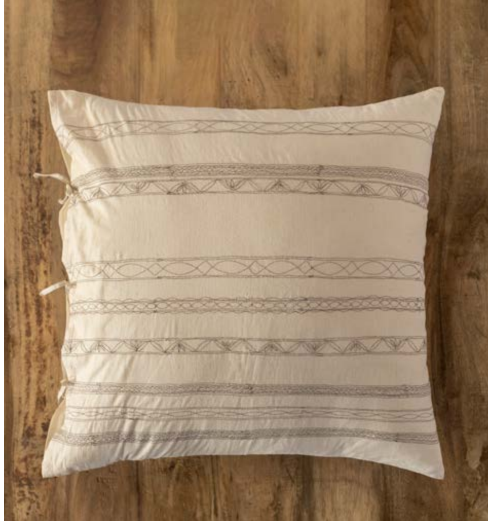
Haru Sham C-2359-24