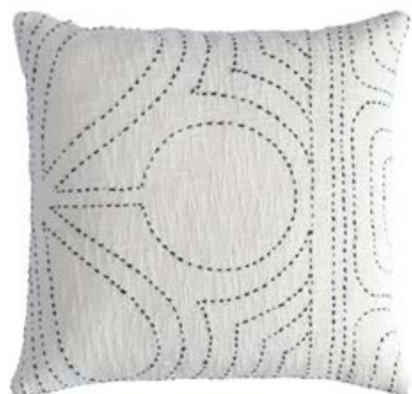
Faye Cushion C-2341-24