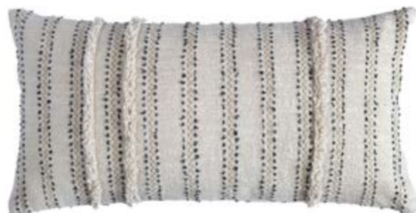
Alin Cushion C-2348-24

Handwoven on looms, this 100% cotton throw features a mix of different textures and yarns. A play of stripes and colour gives off a sense of subtle boldness, yet being a minimally beautiful addition to a home. Each piece is frayed and washed for softness and may vary slightly to reflect human touch of design.