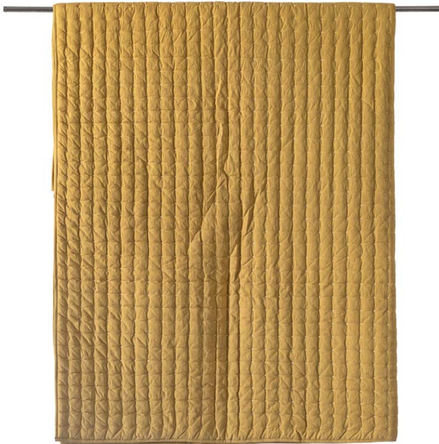
Pebble Quilt Q-2001