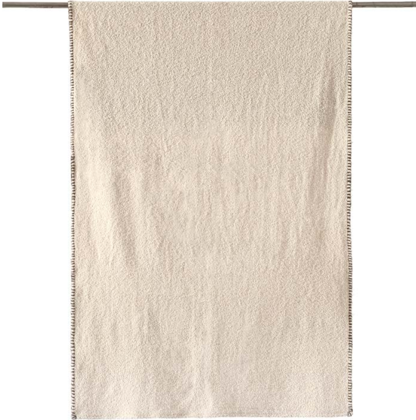
Lumo Throw T-2340-24