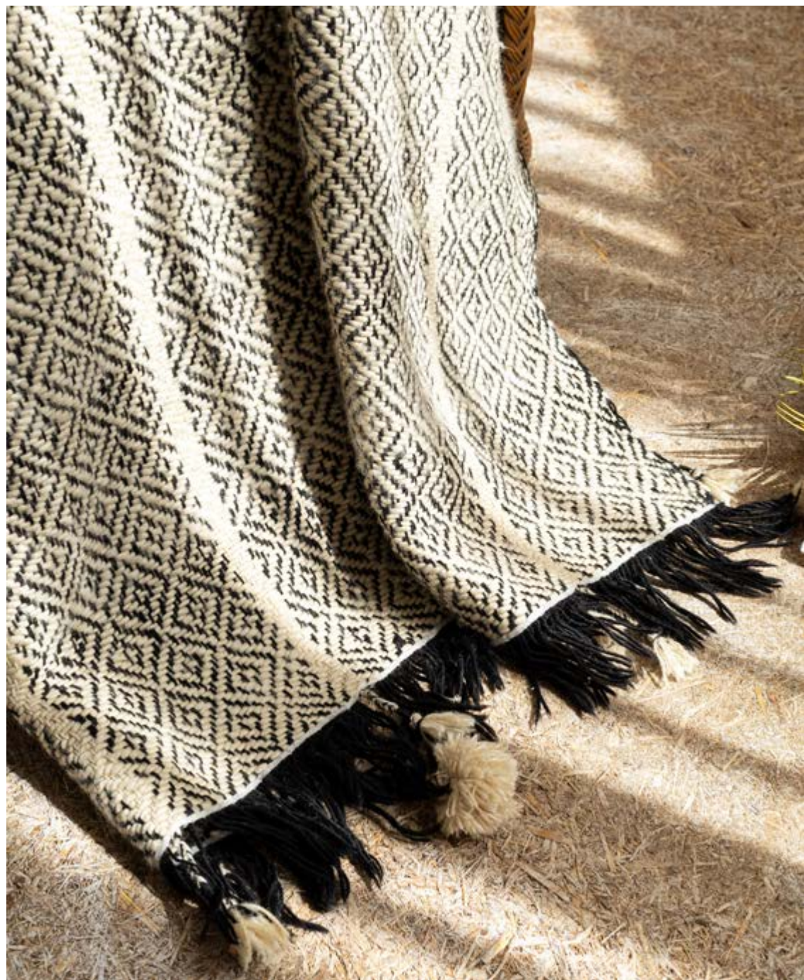
Saltoro Throw T-3424-23