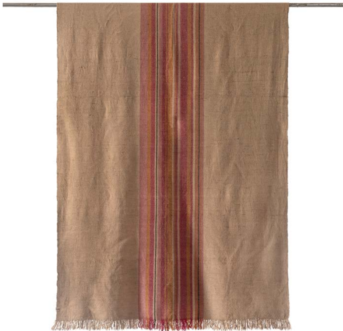
Rosa Throw T-2334-24