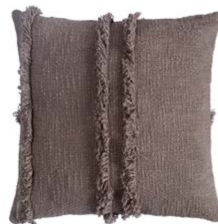
Nami Cushion C-2342-24