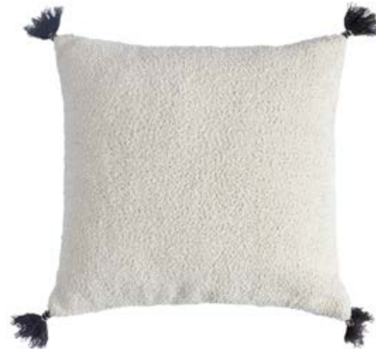
Zuha Cushion C-2346-24