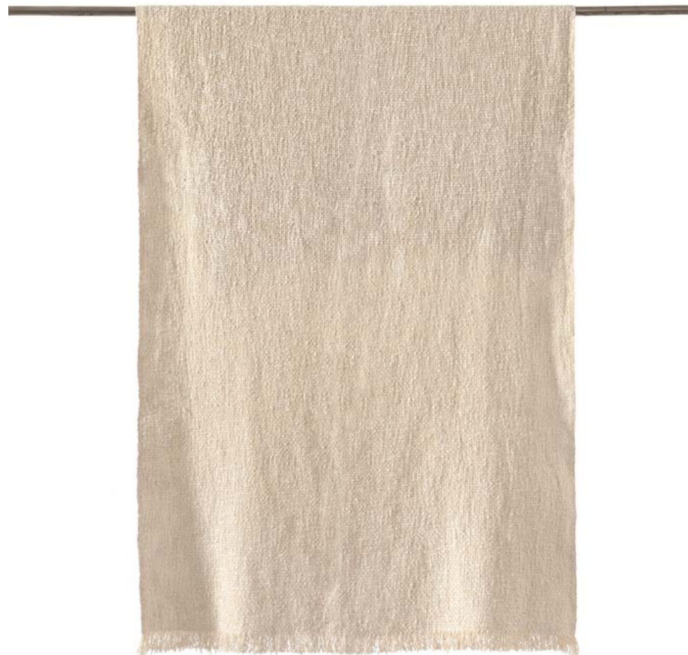
Cruso Throw T-2339-24