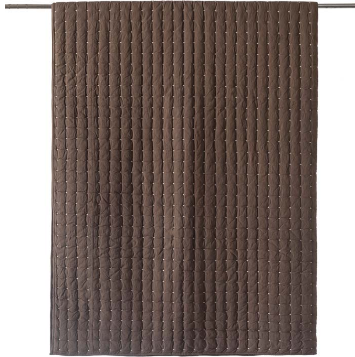
Pebble Quilt Q-2001