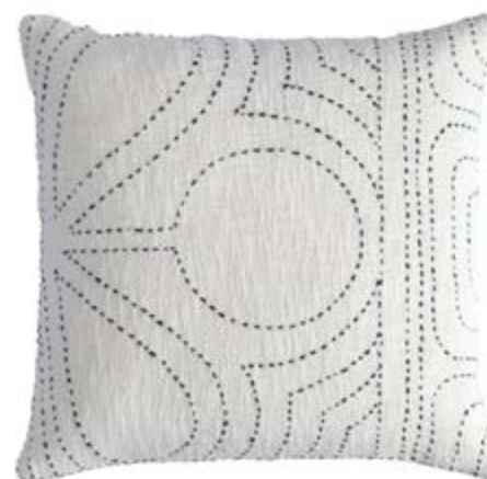
Faye Cushion C-2341-24