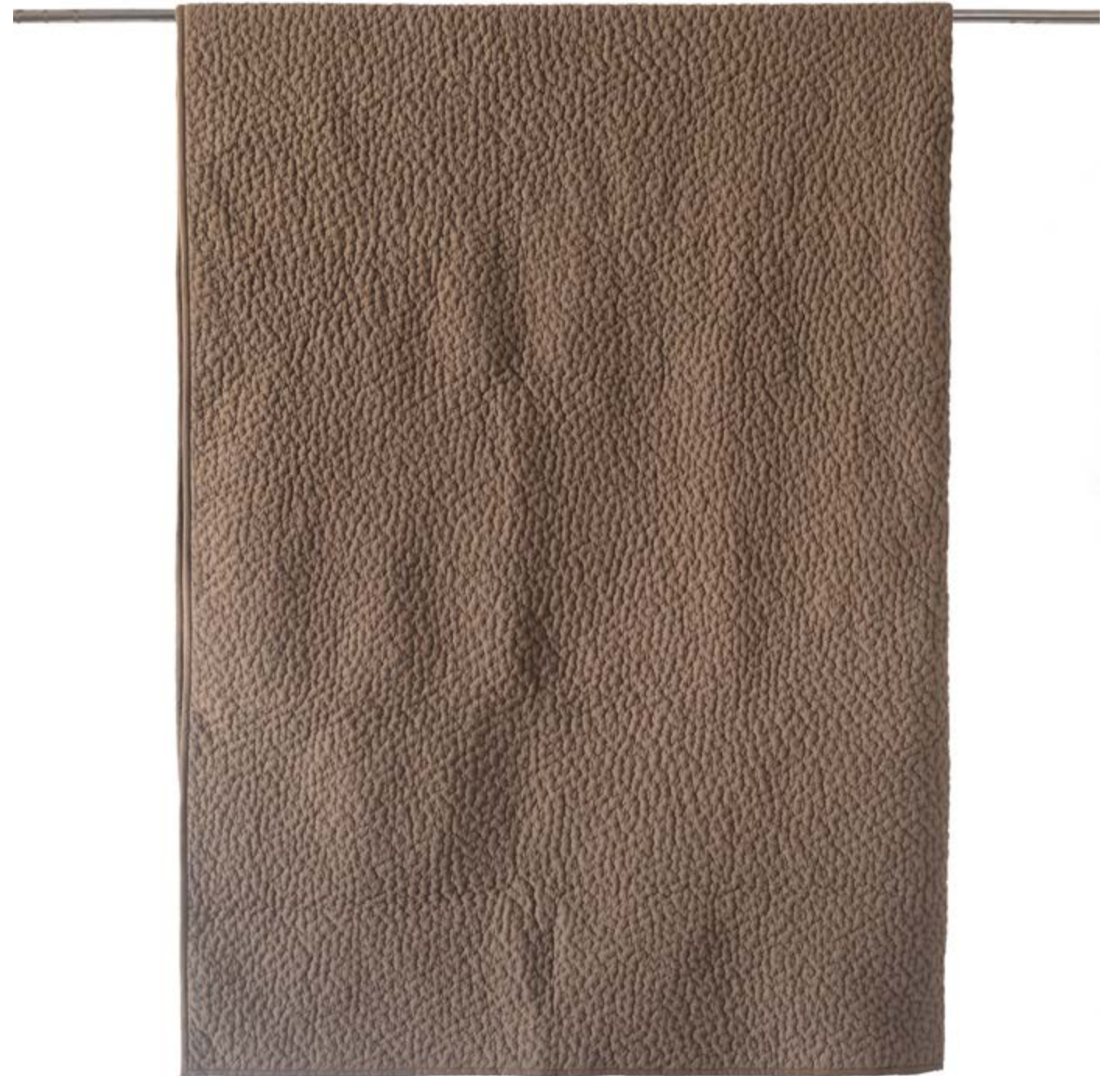
Dune Quilt Q-2365-24