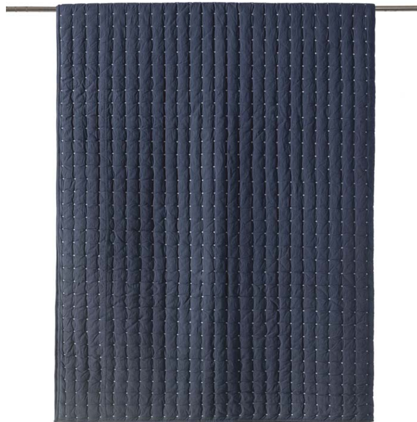
Pebble Quilt Q-2001