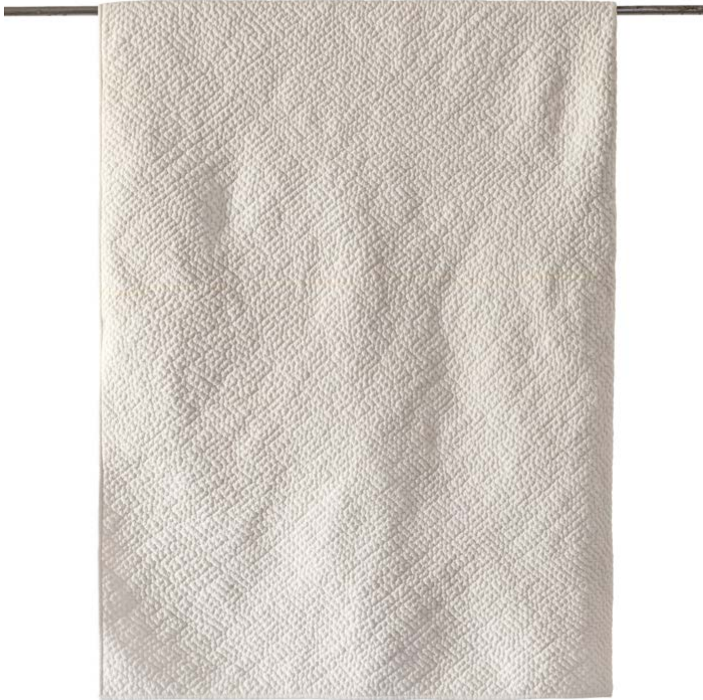
Dune Quilt Q-2365-24