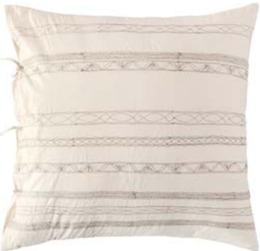
Haru Sham C-2359-24 Natural 26"x26"