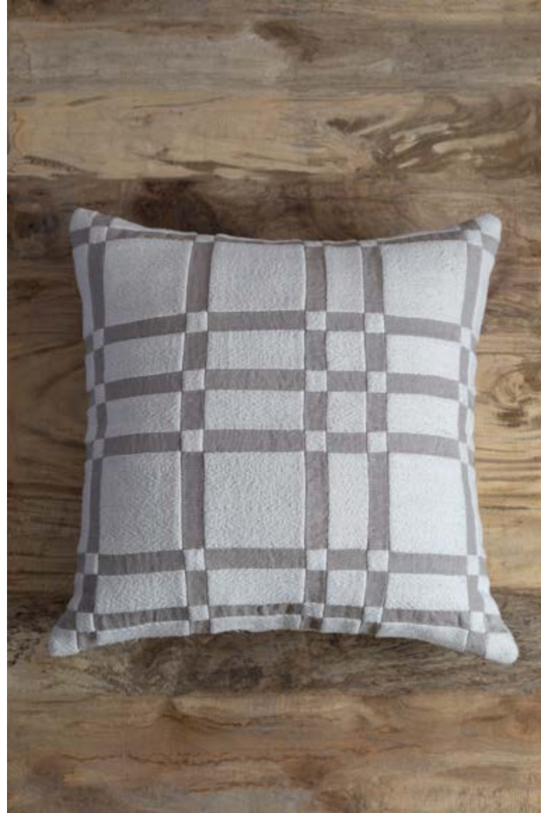
Maive Sham C-2354-24