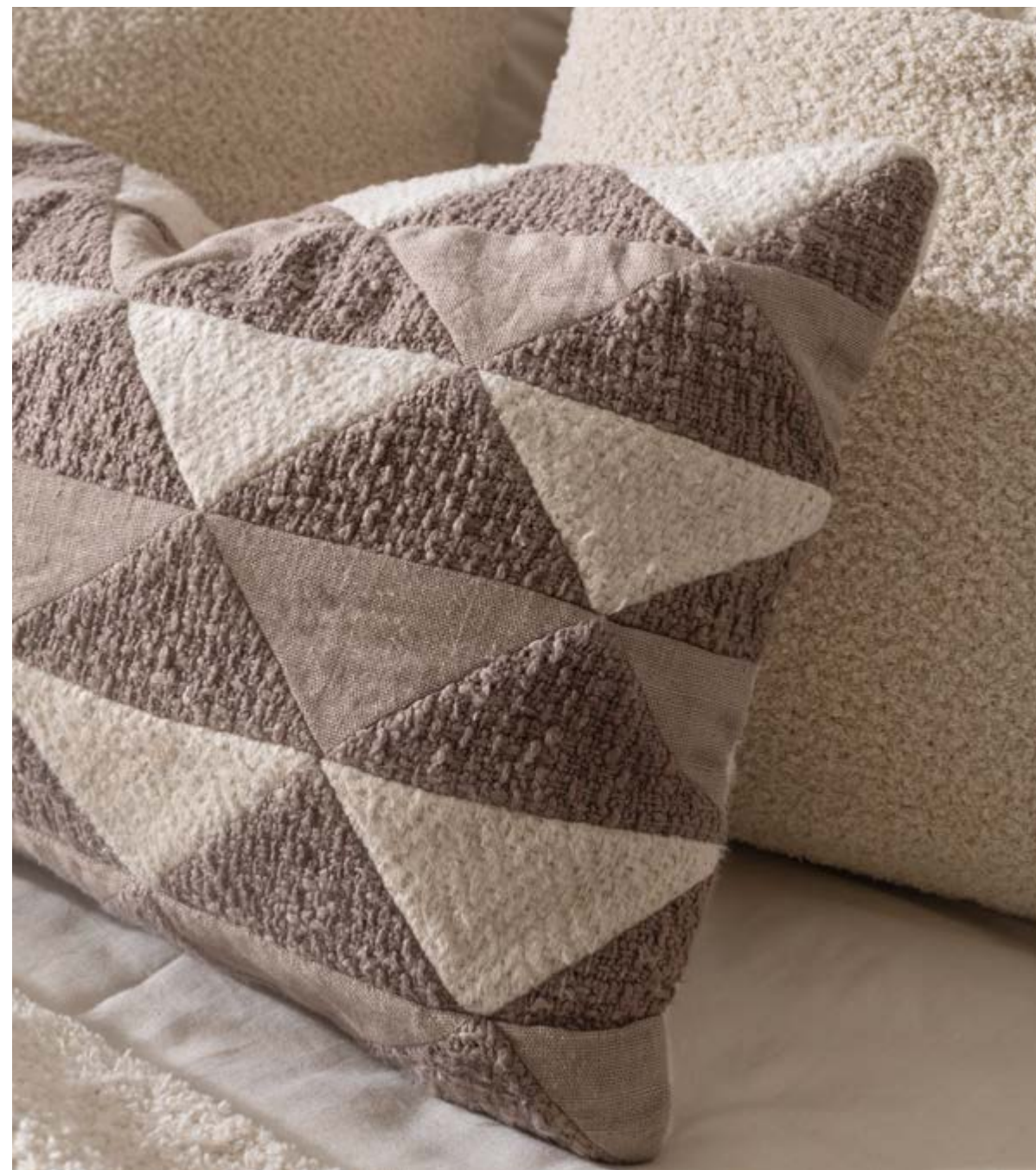
Capa Cushion C-2349-24

Brilliantly soft and luxurious, the Zuha cushion is crafted from 100% cotton boucle. Its unique construction makes it a perfect addition to modern décor. The further addition of beautiful wool tassels on each corner gives a raw appearance. It is handwashed to further achieve a soft and relaxed textural appeal.