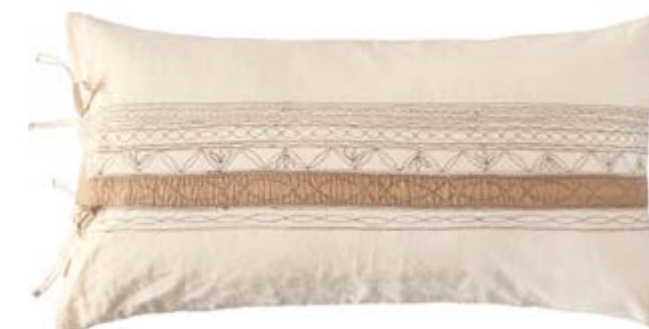
Yumi Cushion C-2352-24