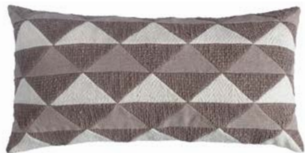
Capa Cushion C-2349-24