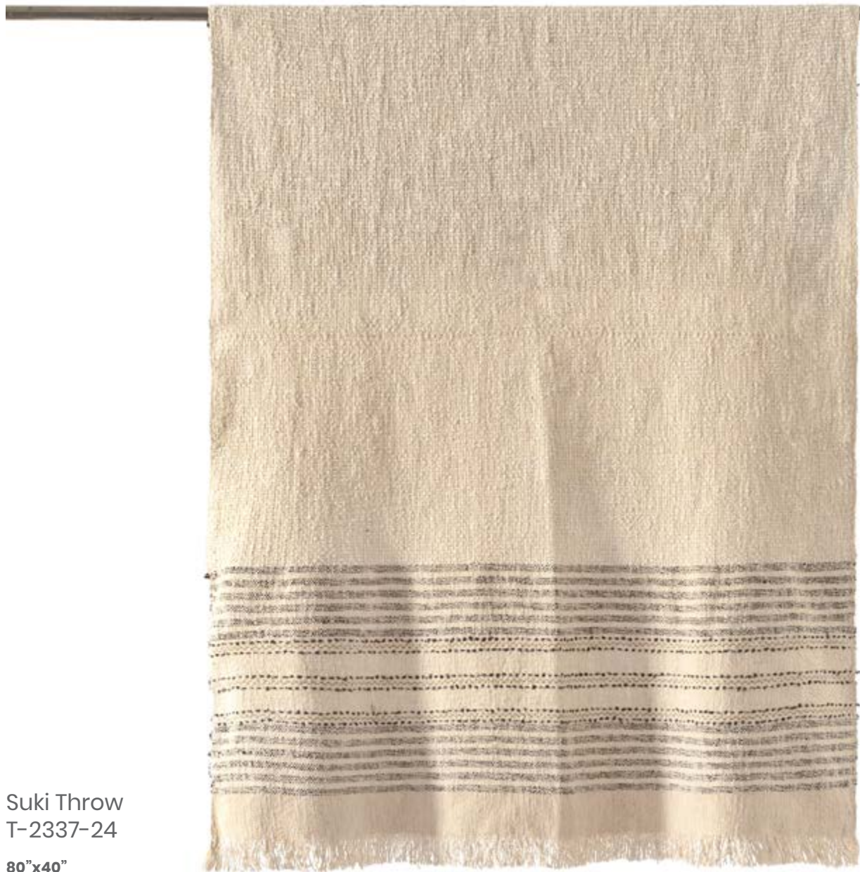
Suki Throw T-2337-24