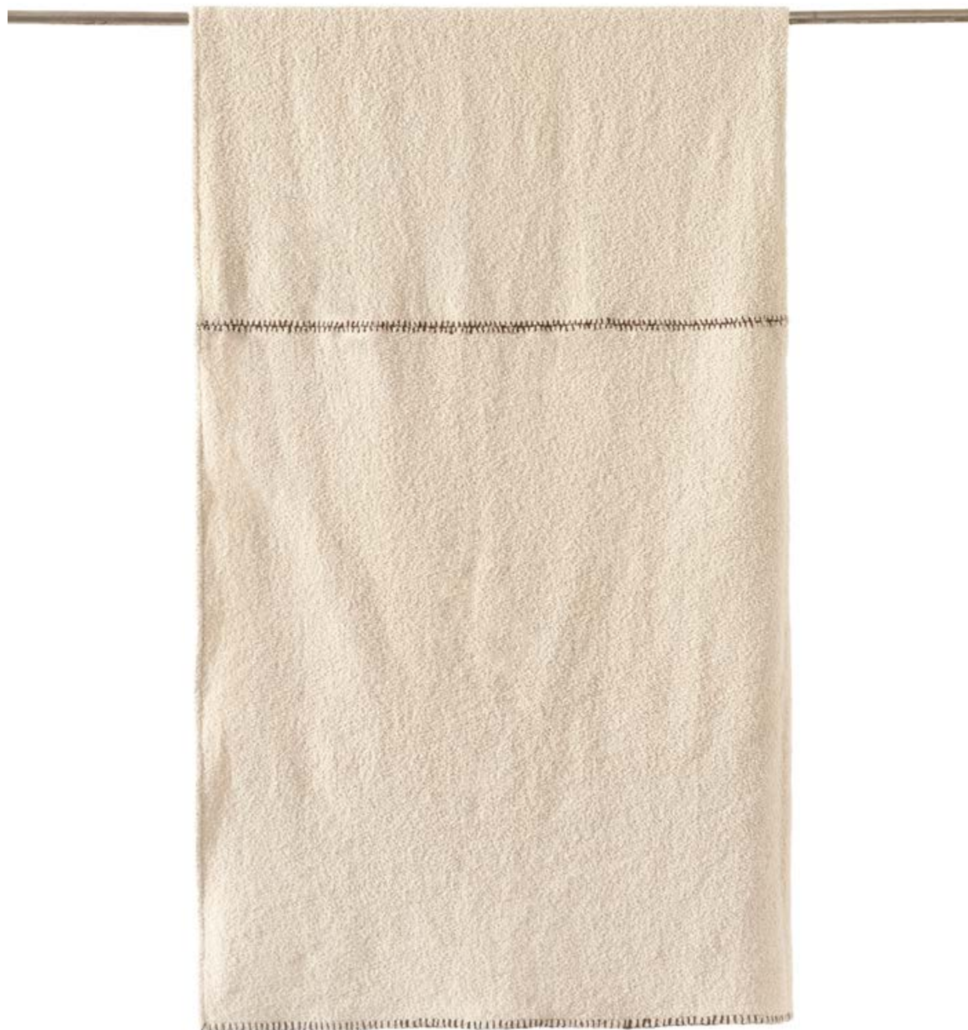
Piora Blanket B-2362-24