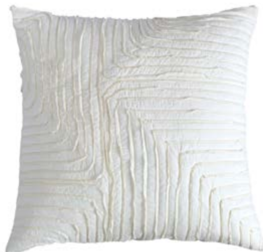
Pearl Sham S-2366-24