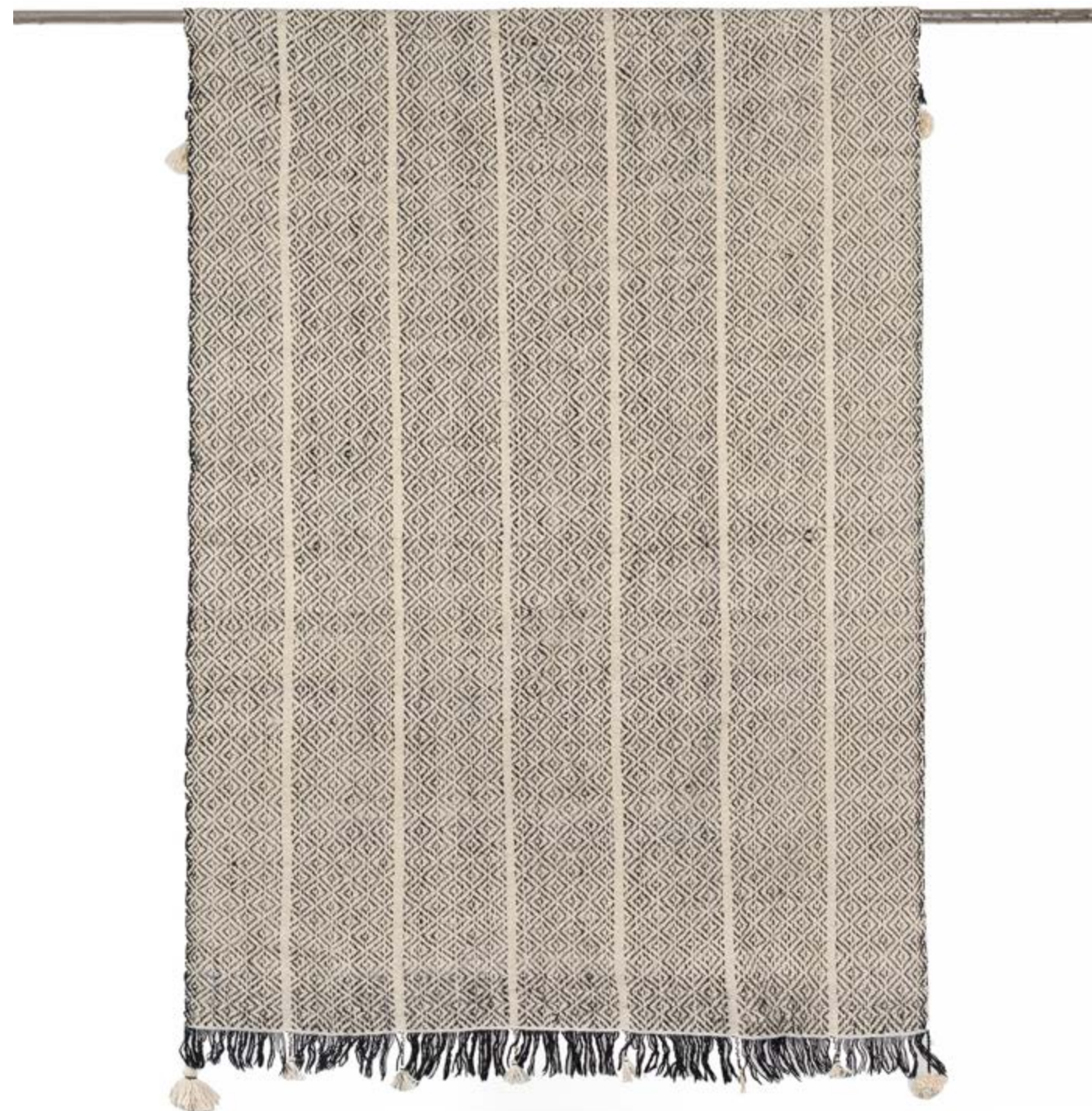
Saltoro Throw T-3424-23