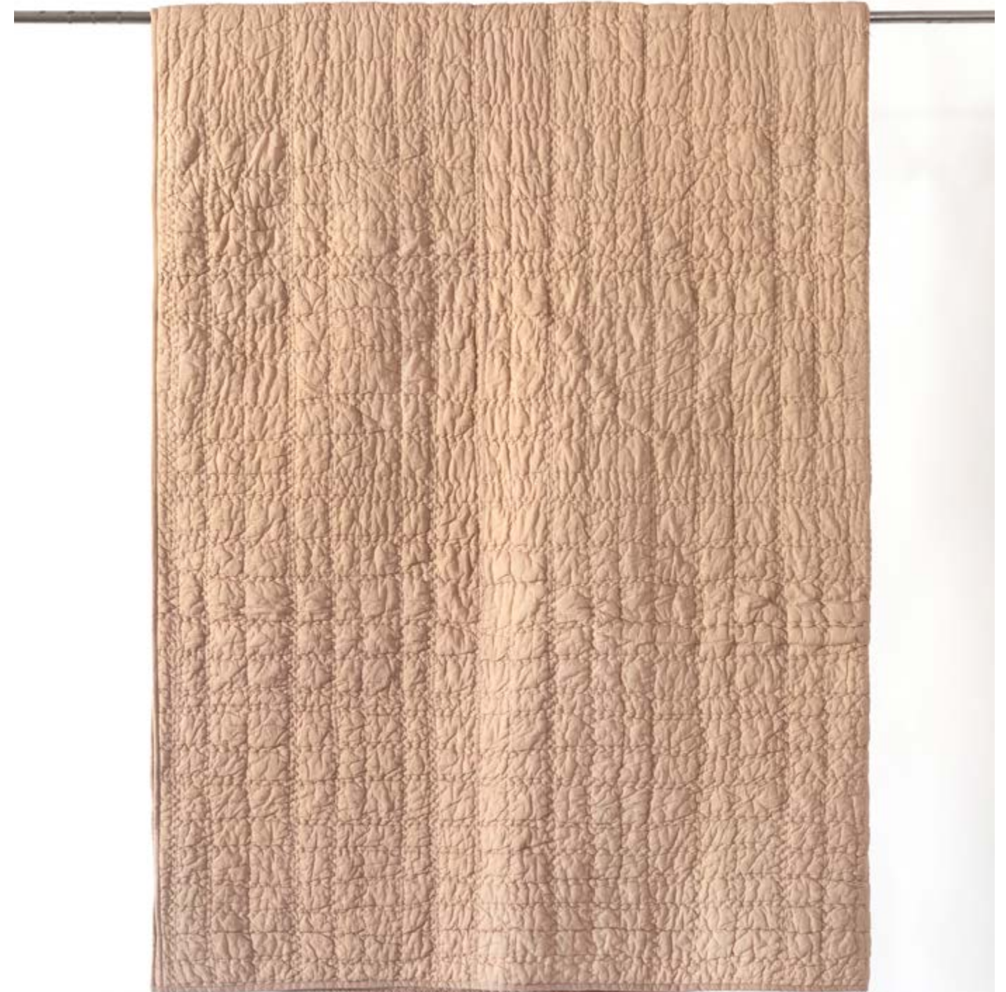
Checkbox Quilt Q-1106