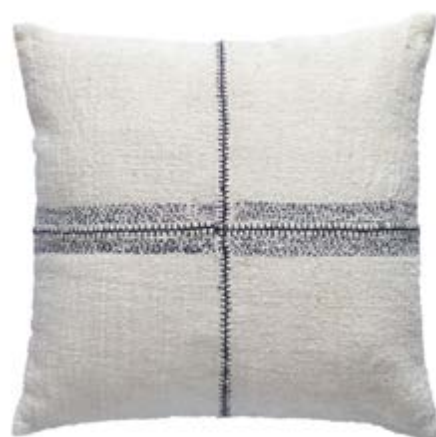
Holly Cushion C-2345-24