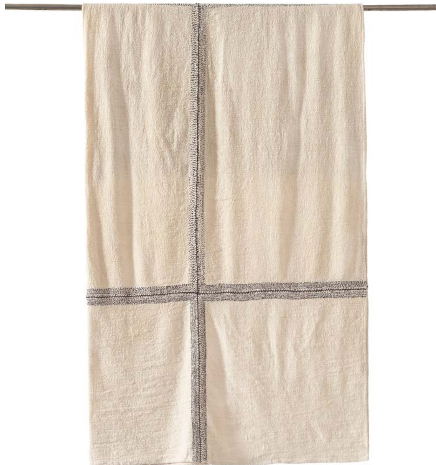
Frost Blanket B-2363-24