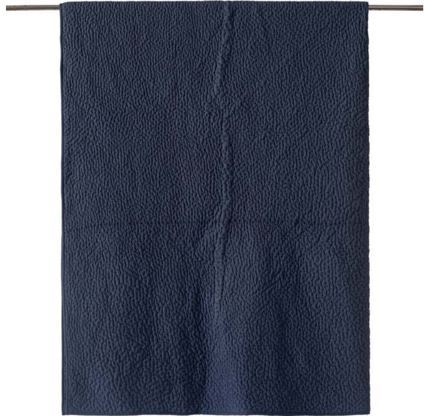
Dune Quilt Q-2365-24