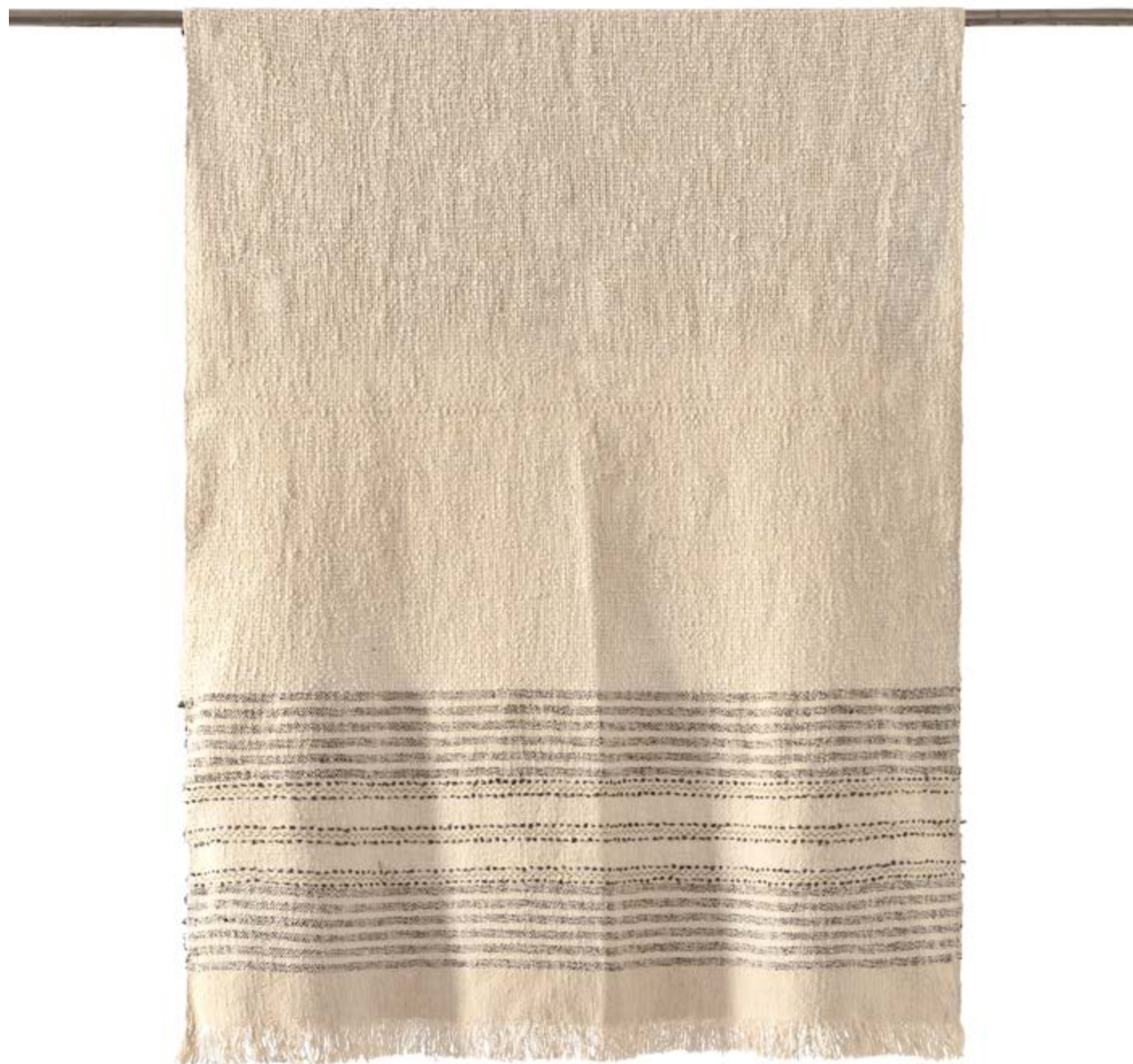
Suki Throw T-2337-24