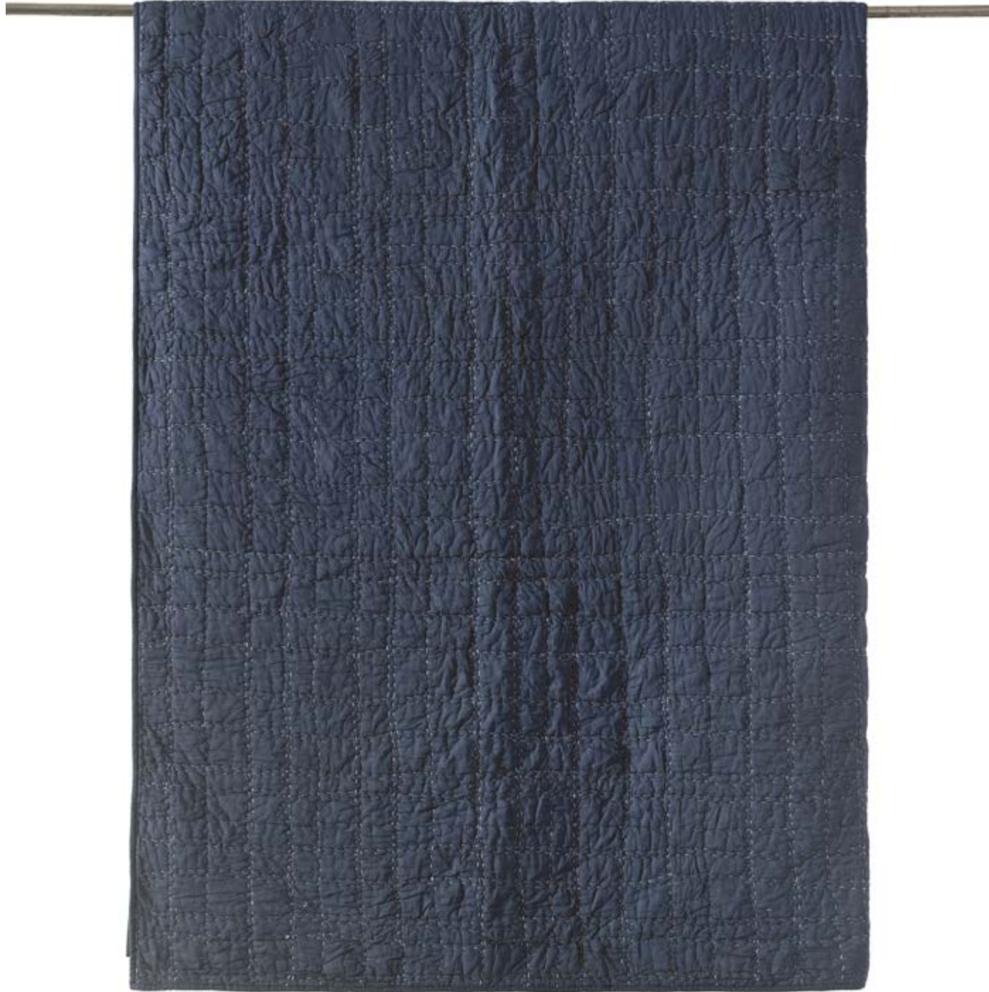
Checkbox Quilt Q-1106