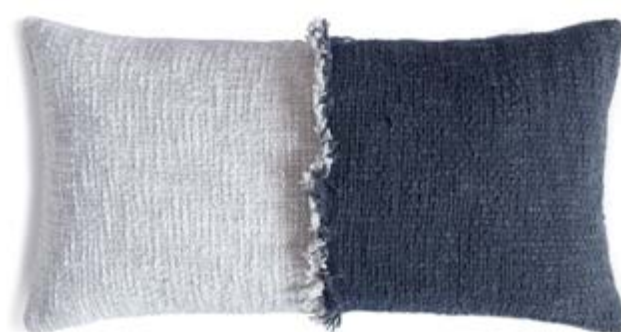
Shiori Cushion C-2353-24