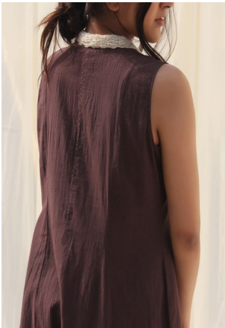
BAILEY JUMPSUIT G 3101