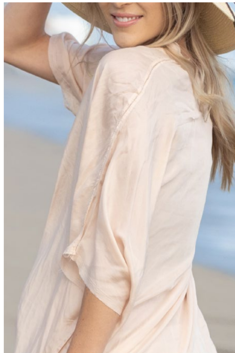
ZIVA SILK KAFTAN G 702 SLK