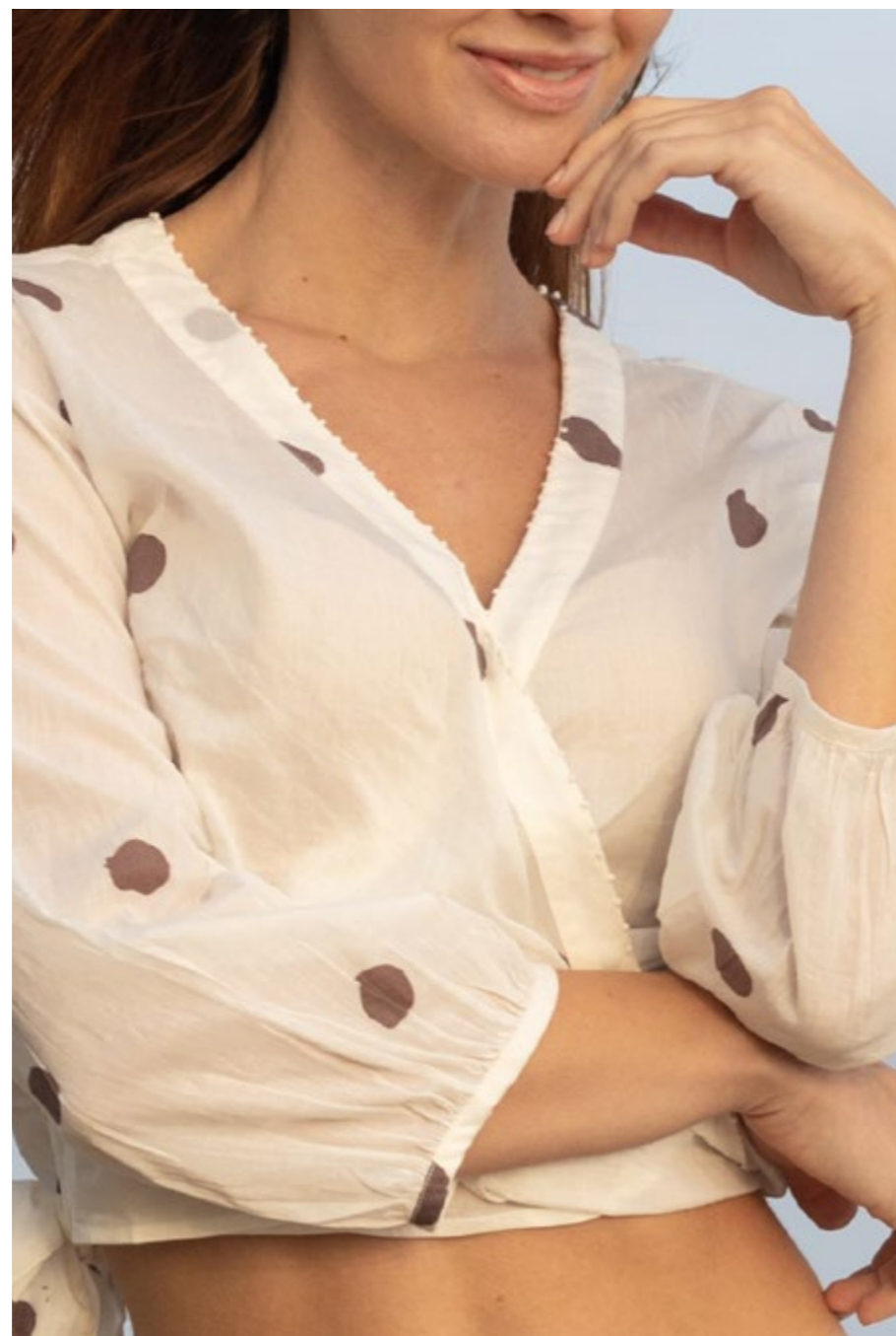
CARA TOP BIG DOT G117 BD