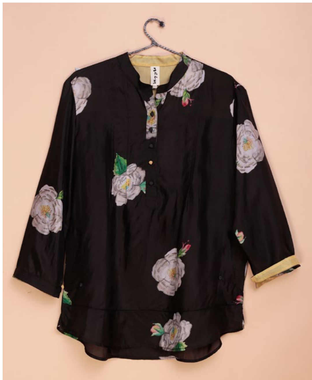
BRYLEE SILK ROSE BUD TOP G 119 SLK RB