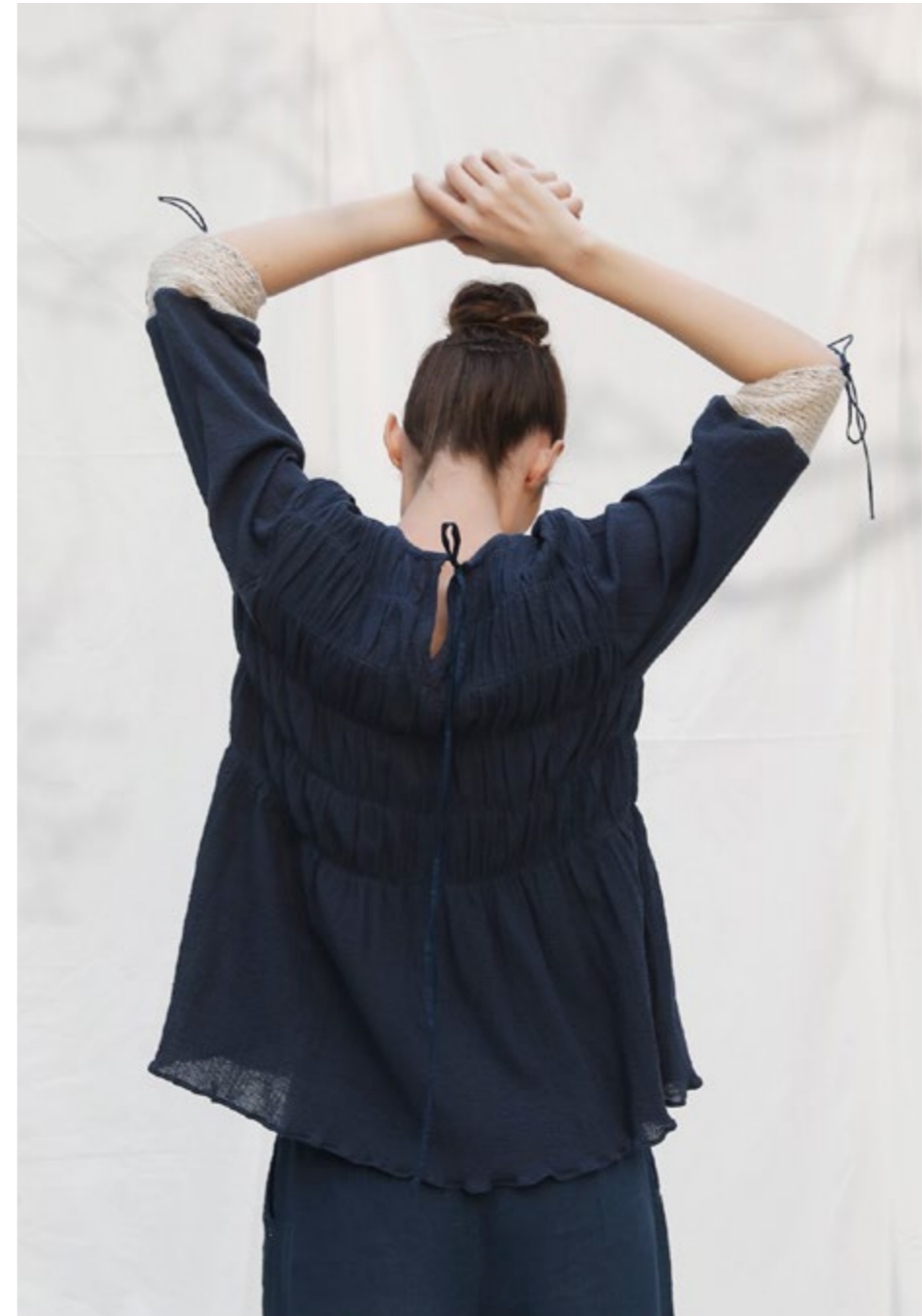
LEYLA TOP G 1106