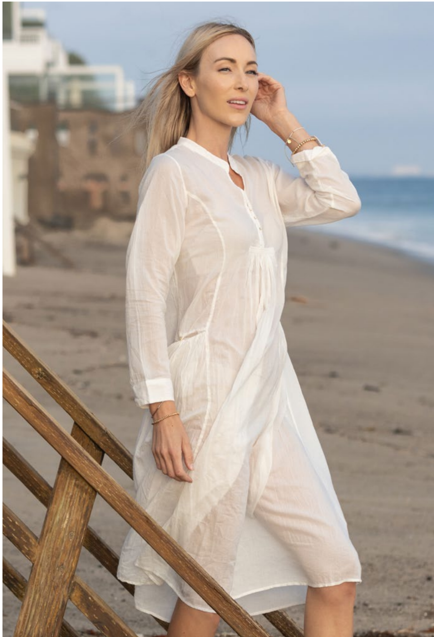
EMMA DRESS G 317