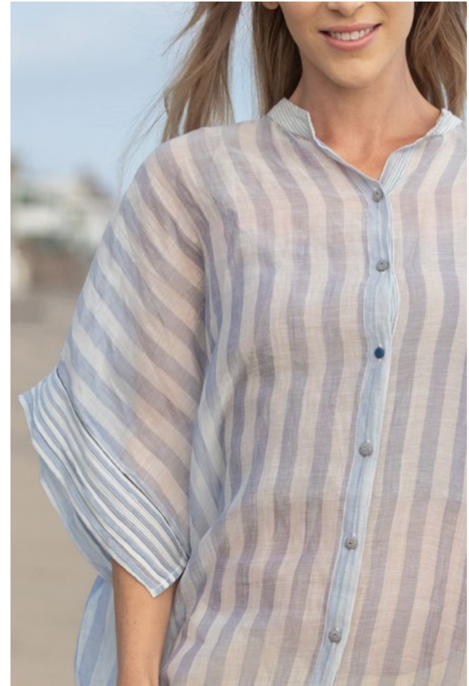
CALLIE BOLD STRIPED KAFTAN G 709 BS