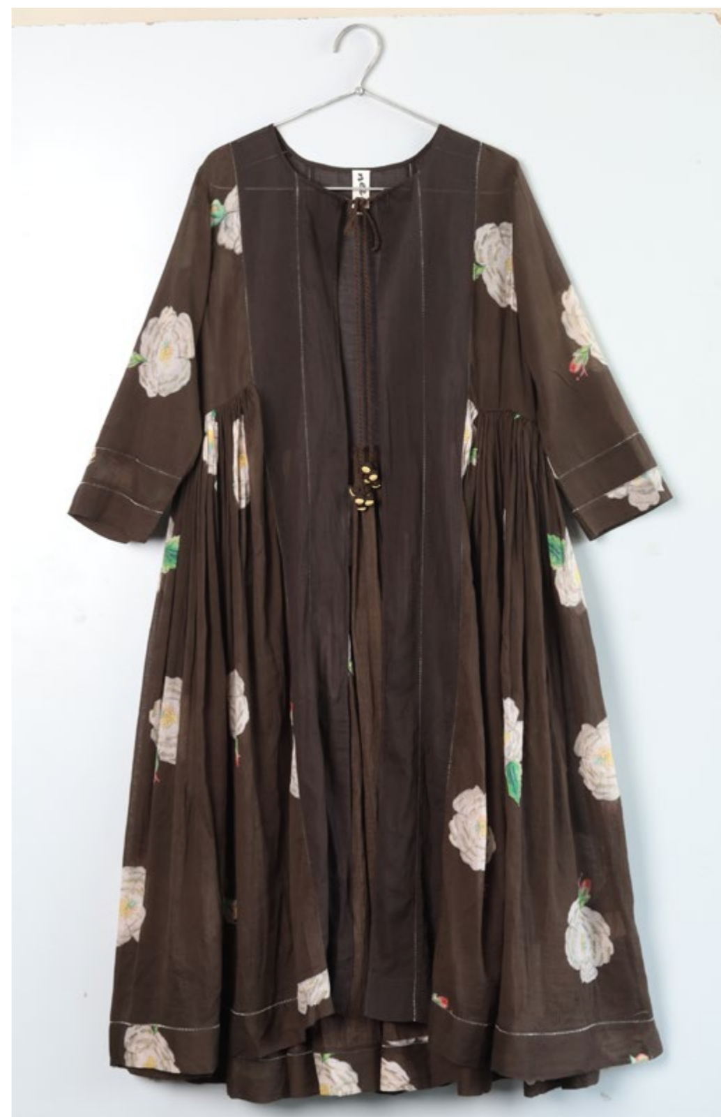
FRANCES ROSE BUD ROBE G911 MLT RB