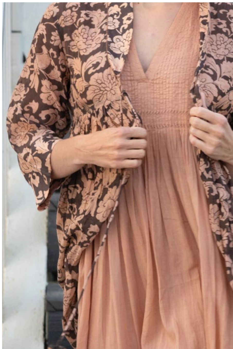
ELEANORE ROBE PARROT PRINT G 305 P