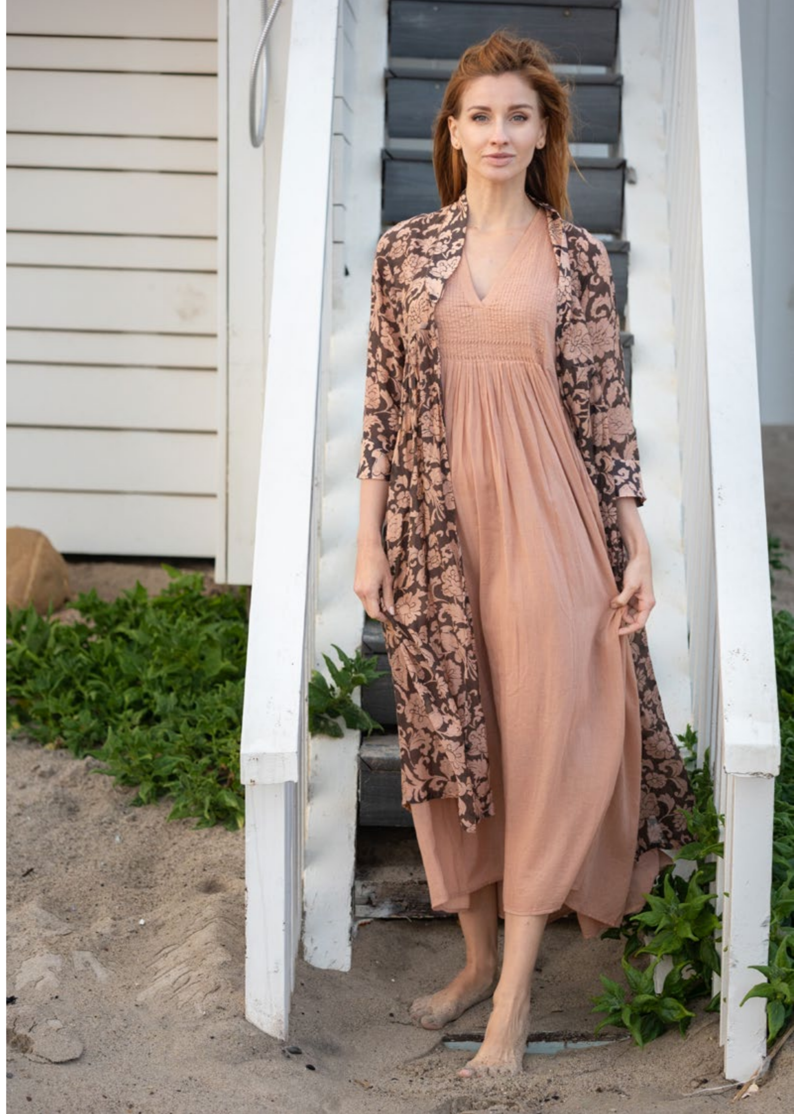
CLARISS DRESS G322