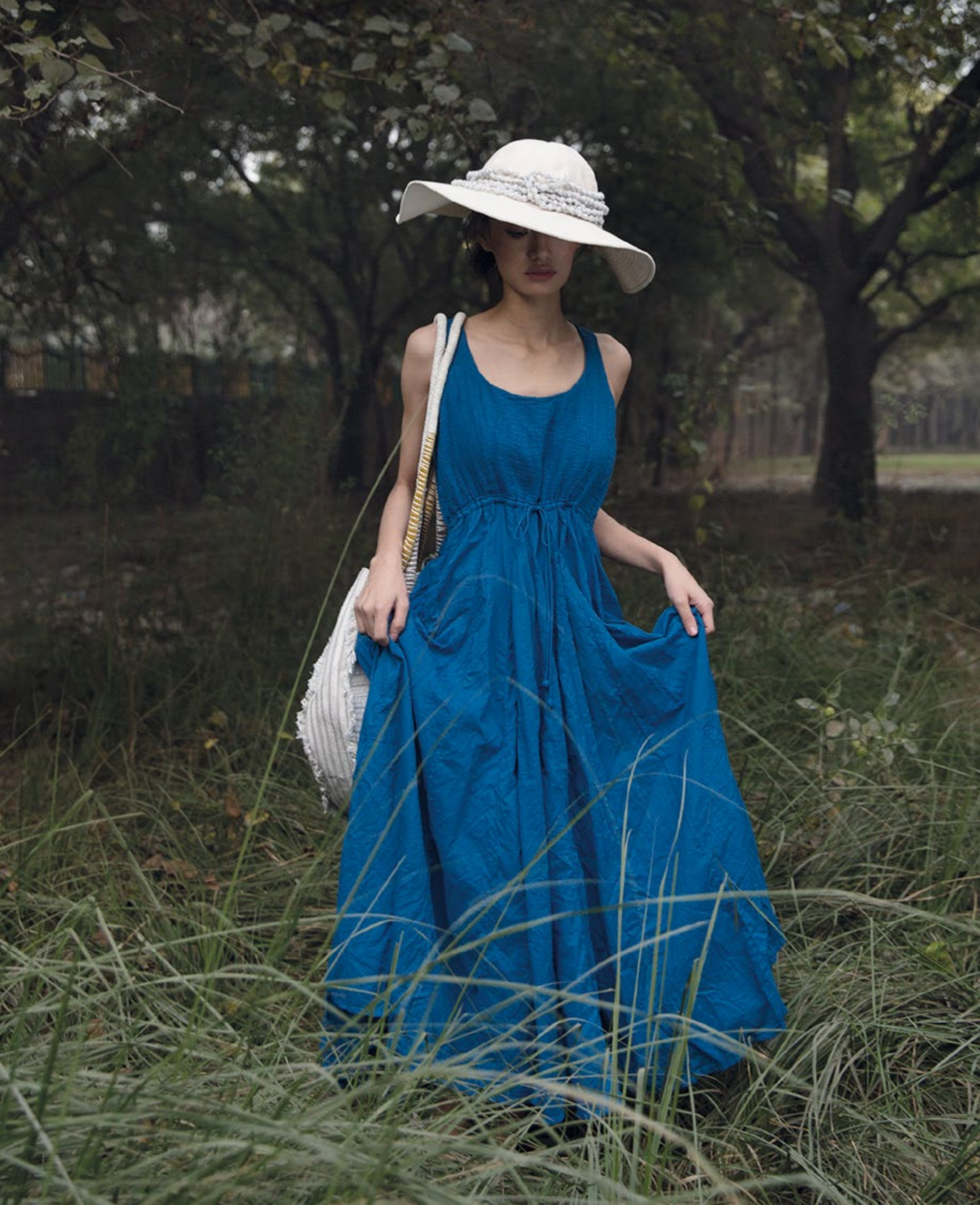
LYDIA DRESS G 301